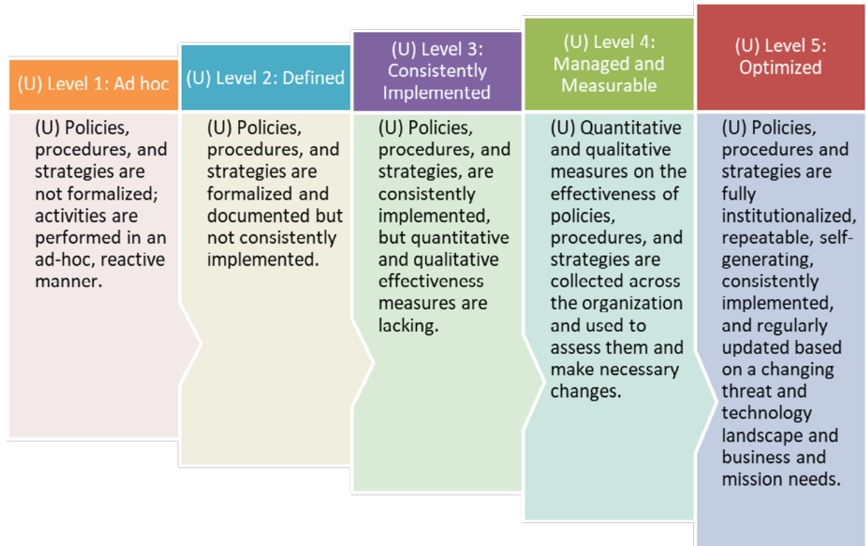
(U) Figure 1. IG FISMA Maturity Model

(U) Source: FY 2021 IG FISMA Reporting Metrics.