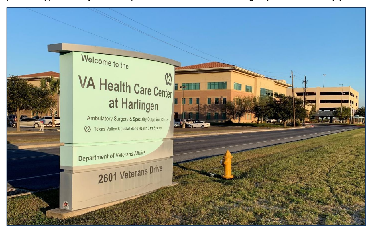
Figure 2. Harlingen VA Health Care Center.

The Harlingen center is part of the Texas Valley Coastal Bend Healthcare System (figure 2). The system completes about 300,000 outpatient visits each year. It operates a 100-patient home-based primary care program and a 200-patient care coordination home telehealth program. By using two inpatient and emergency department contracts with local medical centers, the system provides approximately 1,600 hospital admissions and 1,200 emergency room visits every year.