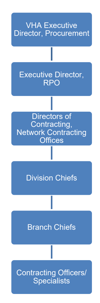
Figure 1. Network contracting hierarchy. Source: RPO Central organizational chart and VHA Procurement Guide.

VHA RPO Central's executive director serves as the head of the contract activity. This is a delegated senior-level position responsible for managing the procurement program at an assigned office, which includes the responsibility to contract for authorized goods and services along with managing the contracting activity.<sup>47</sup> RPO Central is composed of the Program Contracting Activity Central office and seven network contracting offices that serve all or portions of Alabama, Arkansas, Florida, Illinois, Indiana, Iowa, Kansas, Kentucky, Louisiana, Michigan, Minnesota, Mississippi, Missouri, Nebraska, North Dakota, Ohio, Oklahoma, South Dakota, Tennessee, Texas, Virginia, West Virginia, Wisconsin, and Wyoming.