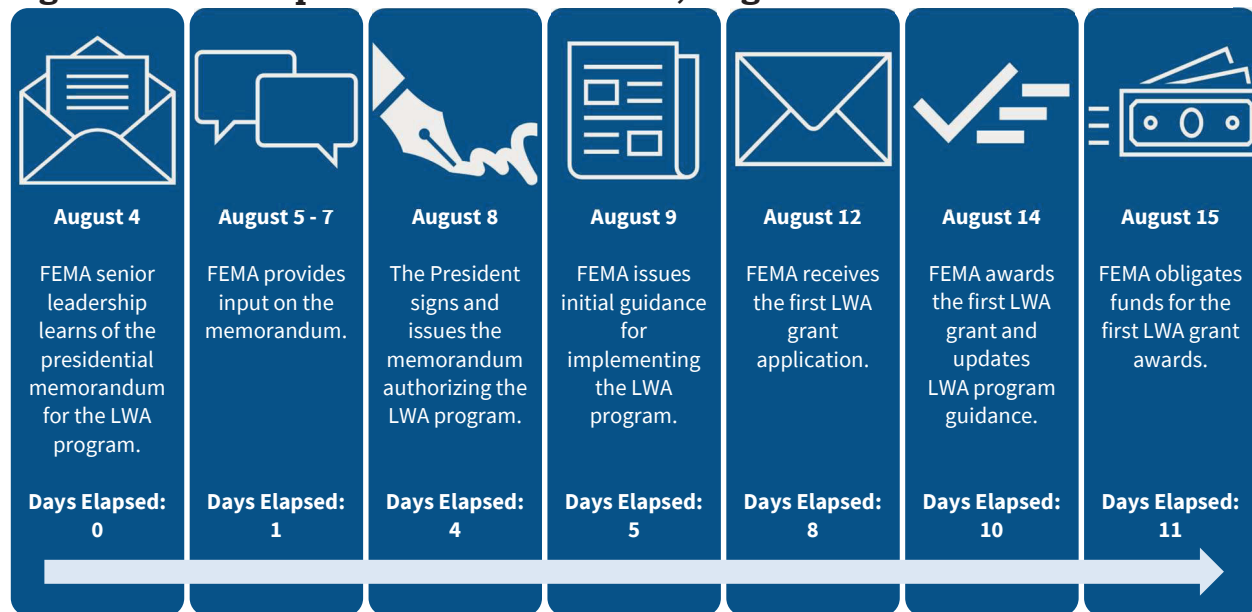
Figure 1: LWA Implementation Timeline, August 2020