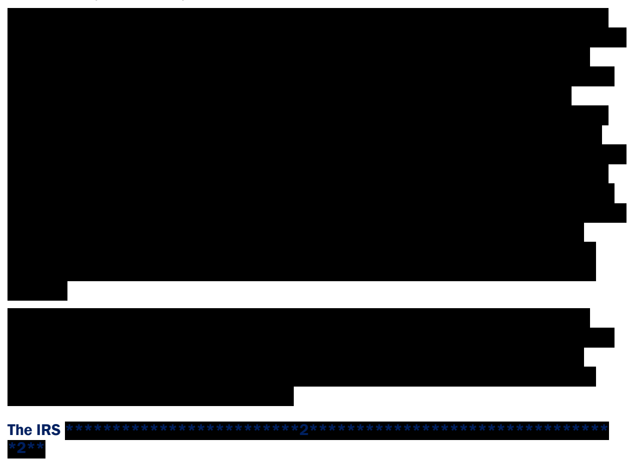
IRM 10.8.24 states that the information system shall generate audit records containing event information that establishes what type, when, where, the source, the outcome, and the identity

The NIST<sup>18</sup> advocates logging any activity related to keys, including their generation, access, modification, revocation, or destruction. In addition, the NIST requires the auditing of activities associated with key management. On a more frequent basis, the actions of the entities that use, operate, and maintain the system should be reviewed to verify that they continue to follow established security procedures and have accessed only those keys for which they are authorized. This is normally accomplished by examining the logs created to record security-relevant events. The NIST further states that strong encryption systems can be compromised by lax and inappropriate actions. Highly unusual events should be noted and reviewed as possible indicators of attempted attacks on the system. In addition, the IRM requires that the IRS reviews and analyzes information systems' audit records at least weekly for indications of inappropriate or unusual activity and reports findings at a minimum to the Information System Security Officer.