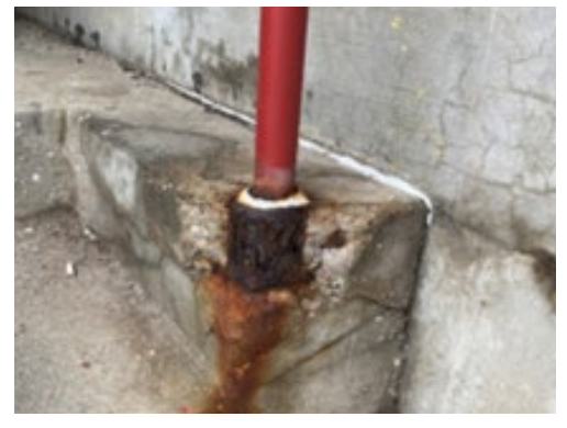
Figure 6. Rusted Handrail