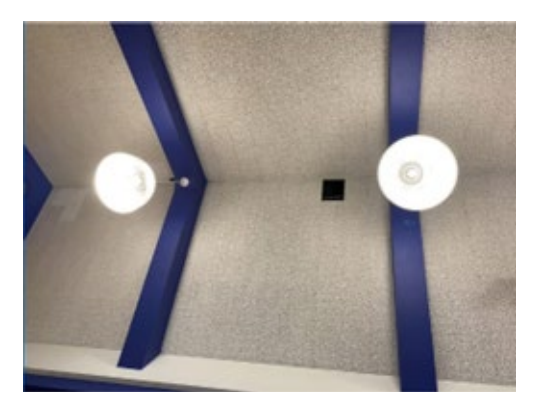
Figure 1. Missing Ceiling Tile