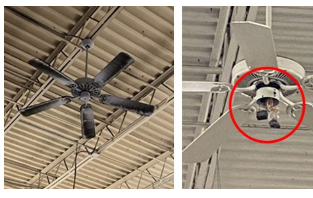
Figure 2. Ceiling Fans