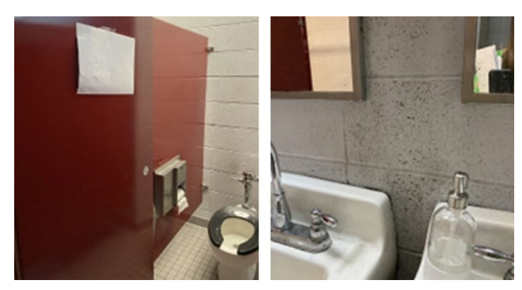
Figure 4. Women's Restroom