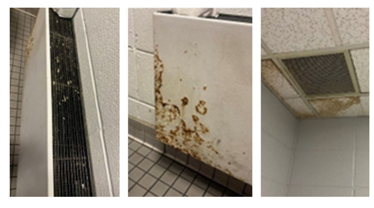
Figure 3. Men's Restroom