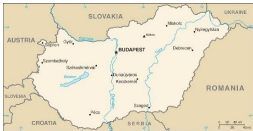
Figure 1: Map of Hungary.

Hungary was part of the Austro-Hungarian Empire, until the empire collapsed during World War I. The country fell under communist rule following World War II and became a member of the Warsaw Pact military alliance led by the Soviet Union, which invaded the country in 1956 to crush a popular uprising. In 1968, Hungary began liberalizing its economy, introducing so-called “Goulash Communism.” With the collapse of Soviet influence,