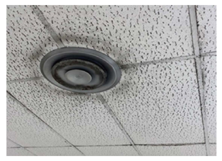
Figure 13. Dust Around Air Vent