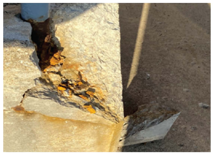
Figure 10. Damaged Concrete