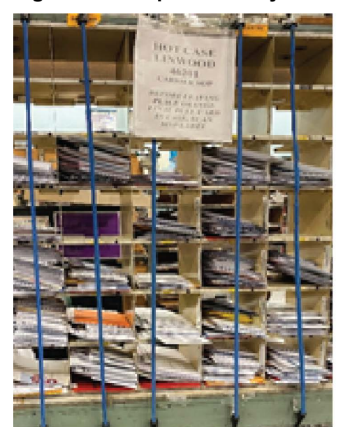
Figure 1. Examples of Delayed Mail