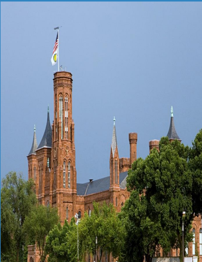
Smithsonian Institution Building (The Castle)