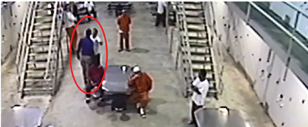
Figure 1. Verbal Altercation between a Staff Member and a Detainee

session. The facility found that the staff member inappropriately ended the detainees' worship session 10 minutes early; the staff member was given counseling as part of the facility's corrective actions. In another grievance, a detainee alleged an officer made unprofessional remarks, spit in his face, and physically hit him. Video surveillance reviews found the staff member approached and stood close to the detainee, with the two men directly in each other's faces during the confrontation (see Figure 1). Facility management placed the staff member on administrative leave pending an Office of Professional Responsibility investigation, but the staff member resigned during the investigation.