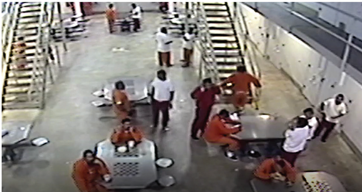
Figure 2. South Texas Detainees Not Wearing Masks and Not Practicing Social Distancing on September 15, 2021