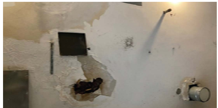
Figure 6. Holes in the Boiler Room Ceiling