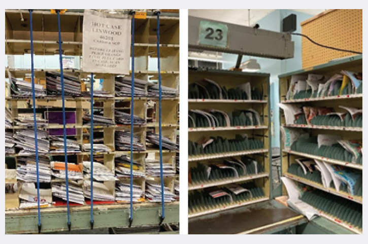
Figure 1. Examples of Delayed Mail