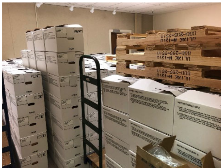
Figure 5: Records at ONHIR Being Prepared To Send to NARA