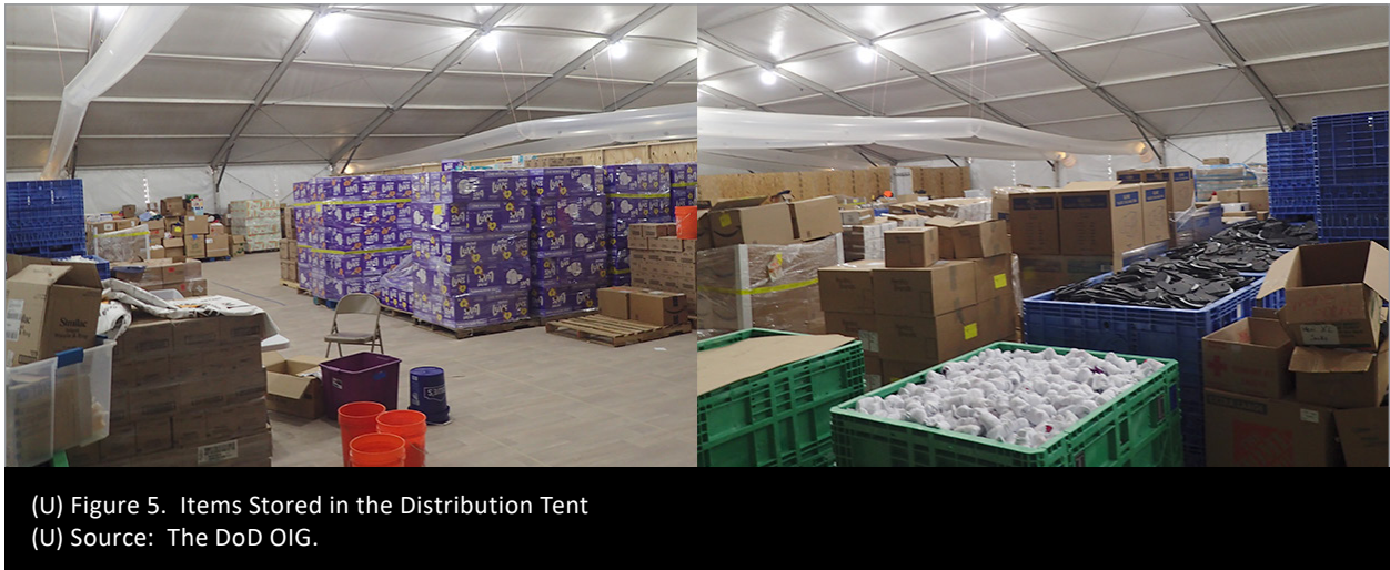
(U) Figure 5. Items Stored in the Distribution Tent (U) Source: The DoD OIG.

wristband numbers—Afghan evacuees with wristband numbers ending in 0 through 4 had a specified collection day, and Afghan evacuees with wristband numbers ending in 5 through 9 had a different day to collect these items. TF Holloman personnel stated that the task force enacted this plan to ensure an equitable distribution of items. Figure 5 shows items stored in the distribution tent.