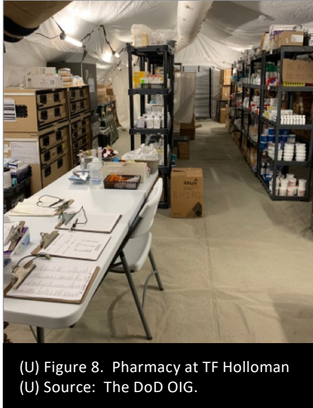
(U) Figure 8. Pharmacy at TF Holloman (U)

(U) in the Alamogordo, New Mexico region. TF Holloman medical officials stated that the majority of acute care provided to Afghan evacuees was pharmacy services and urgent care, such as treating strep throat, skin conditions, and dental needs. According to a TF Holloman medical official, the U.S. Public Health Service, through the DHS, supported TF Holloman by providing behavioral health assistance for Afghan evacuees. Additionally, TF Holloman medical officials dispensed prescription medication and administered pregnancy tests.