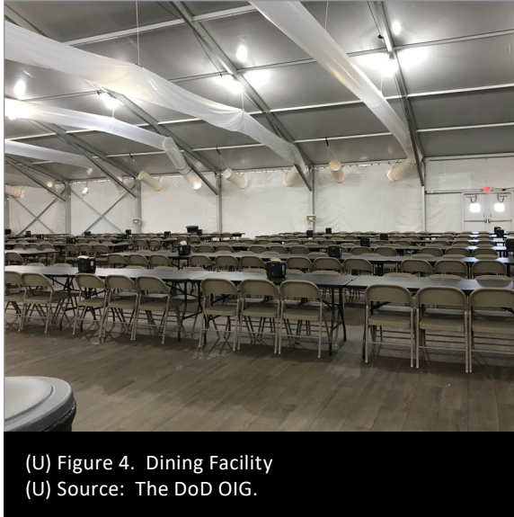
(U) Figure 4. Dining Facility (U) Source: The DoD OIG.

(U) Figure 4 shows the interior of the dining facility.