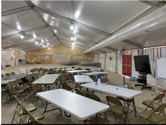
(U) Figure 9. Multipurpose Tent Arranged for a Mixed-Gender Meeting (U)

(U) provide Afghan evacuees with information regarding their resettlement dates or details of their relocation but referred them to DOS officials on site. Figure 9 shows the inside of a multipurpose tent arranged for the mixed-gender meeting.