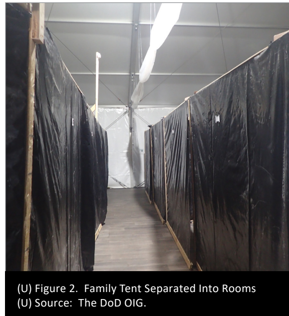
(U) Figure 2. Family Tent Separated Into Rooms (U)

(U) TF Holloman officials partitioned the family and female-only tents into individual rooms, with walls constructed of either plywood or fire-retardant black plastic sheeting. A TF Holloman official stated that the initial plan was to construct all partitions from plywood, but due to supply shortages of plywood in the surrounding area, TF Holloman used plastic sheeting instead. Each room housed up to three adults and two children, and rooms were connected for larger families. In the tents for single males, TF Holloman officials constructed 10-person “pods” separated by plywood half-walls. Figure 2 shows a family tent separated into rooms.