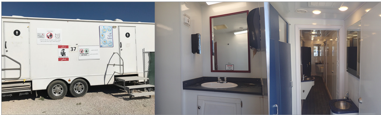
(U) Figure 3. Restroom and Shower Facilities (U)

(U) The village had 90 gender-segregated restroom and shower trailers. TF Holloman surrounded the women's facilities with privacy screens. Contractor personnel cleaned the restroom and shower trailers three times per day, and posters on the trailers provided instructions for contacting the contractor for additional cleaning services. Additionally, contractor personnel provided laundry drop-off services and a linen exchange for sheets, towels, and blankets. Figure 3 shows the restroom and shower facilities.