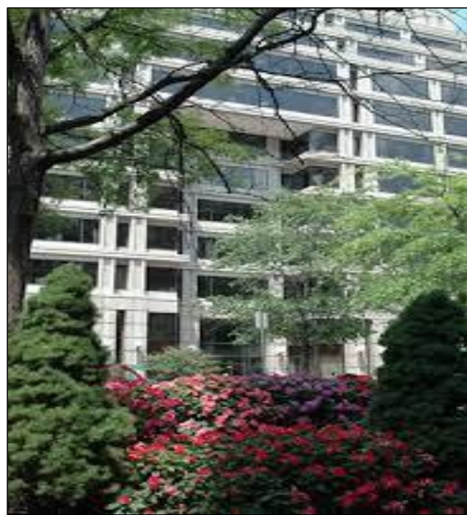
DNFSB Headquarters, Washington DC

According to 42 U.S.C. § 2286a(a), the mission of the Board "shall be to provide independent analysis, advice, and recommendations to the Secretary of Energy to inform the Secretary, in the role of the Secretary as operator and regulator of the defense nuclear facilities of the DOE, in providing adequate protection of public health and safety at such defense nuclear facilities, including with respect to the health and safety of employees and contractors at such facilities." A notable addition to the mission statement was issued in the January 2020 version of 42 U.S.C. § 2286a(a) as amended by the National Defense Authorization Act (NDAA) for Fiscal Year 2020 (Pub. L. No. 116-92, December 20, 2019); that is, the last phrase, "...including with respect to the health and safety of employees and contractors at such facilities." This phrase reflects Congress' intent to ensure the Board and all stakeholders understand the DNFSB's mission clearly encompasses the health and safety of workers as well as the public. This clarification had not yet been incorporated in the Board's advertised mission statement on its website, a key point of interface with the public, as of late August 2021.