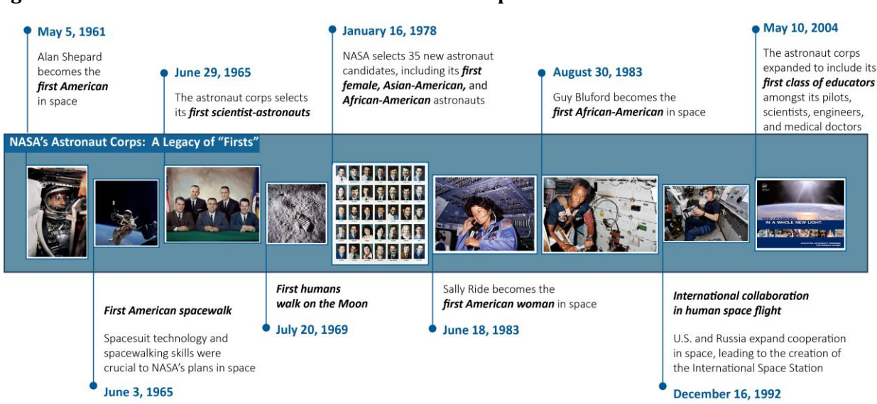
Figure 2: Historic Moments for NASA's Astronaut Corps

today. NASA started selecting a broader mix of specialists for the corps beginning in 1965 by including doctors, scientists, and engineers and later by expanding to the more general category of mission specialists in 1978. In addition to broadening its range of technical backgrounds, NASA hired its first female, Asian-, and African-American astronauts in 1978, its first Hispanic/Latino-American astronaut in 1980, and first member of a Native American tribe in 1996.<sup>2</sup> Figure 2 provides a timeline of historic moments of increased diversity within the corps. Today's astronauts represent a diverse group of men and women equipped with multiple skillsets, comprised of civil servants hired directly by NASA and detailees from the Armed Forces.