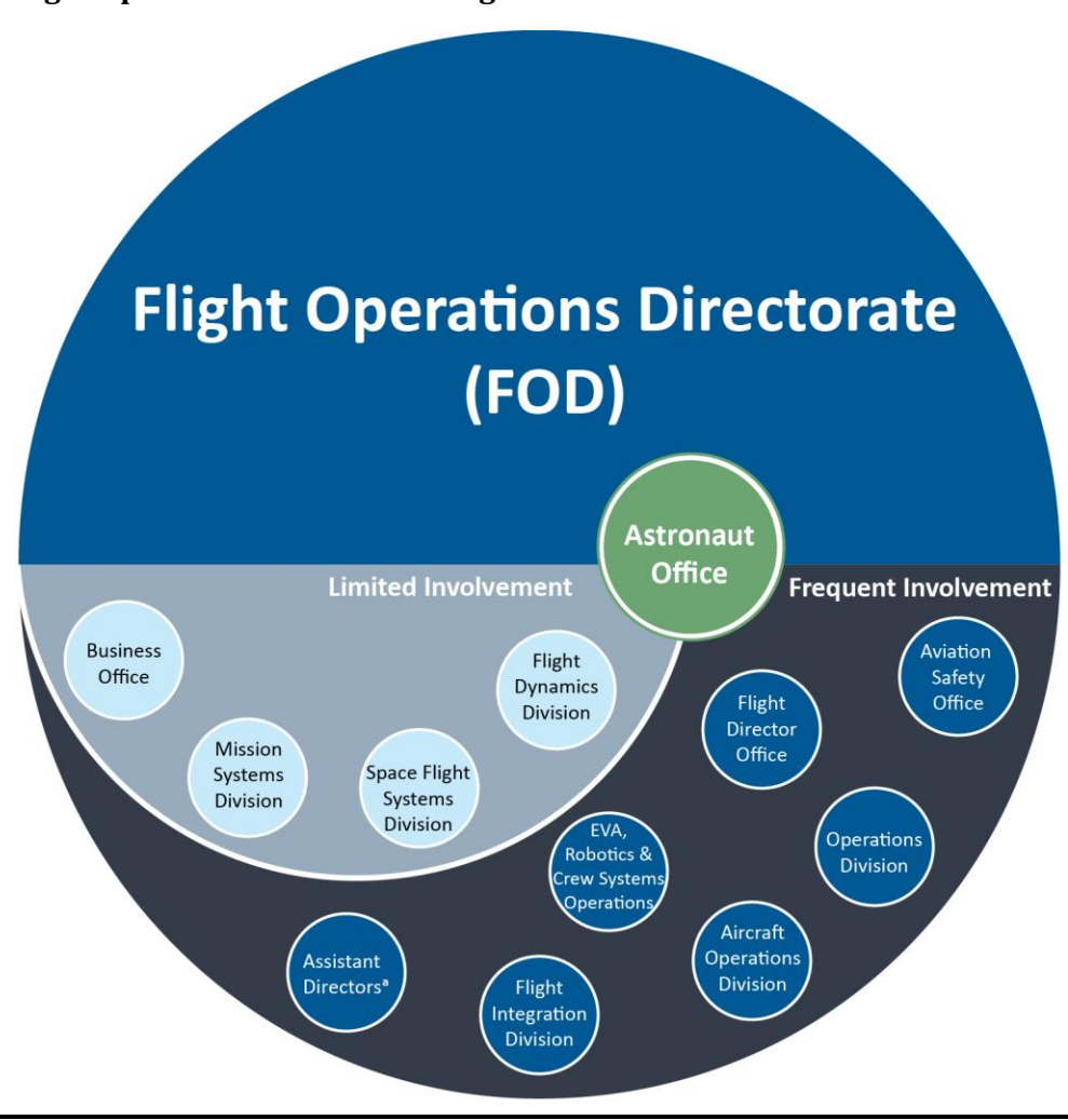
Figure 5: Flight Operations Directorate Organizational Structure