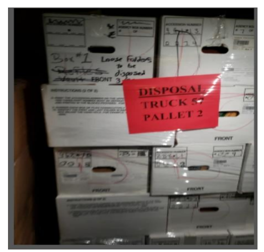
Figure 2 – Pallet of transfers loaded on disposal truck at WNRC

performing physical disposal. FRC staff physically remove transfers from shelves, stack transfers on pallets, and load pallets onto trucks for shipment to a disposal contractor (see Figure 2).