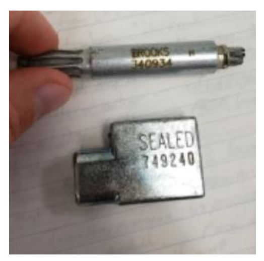
Figure 3 – Truck Seals

Once the transfers have left the FRC on the truck, FRC staff changes the transfer status in ARCIS to Disposed. All documentation and artifacts related to the disposed transfers are gathered by FRC staff and saved in disposal documentation packages. The packages create an auditable package illustrating the FRC's due diligence in ensuring disposals were authorized and performed. NARA 1464 SOP details documentation required to be kept including various ARCIS reports, evidence of agency concurrence, shipping documents, disposal certifications, and returned truck seals (see Figure 3).