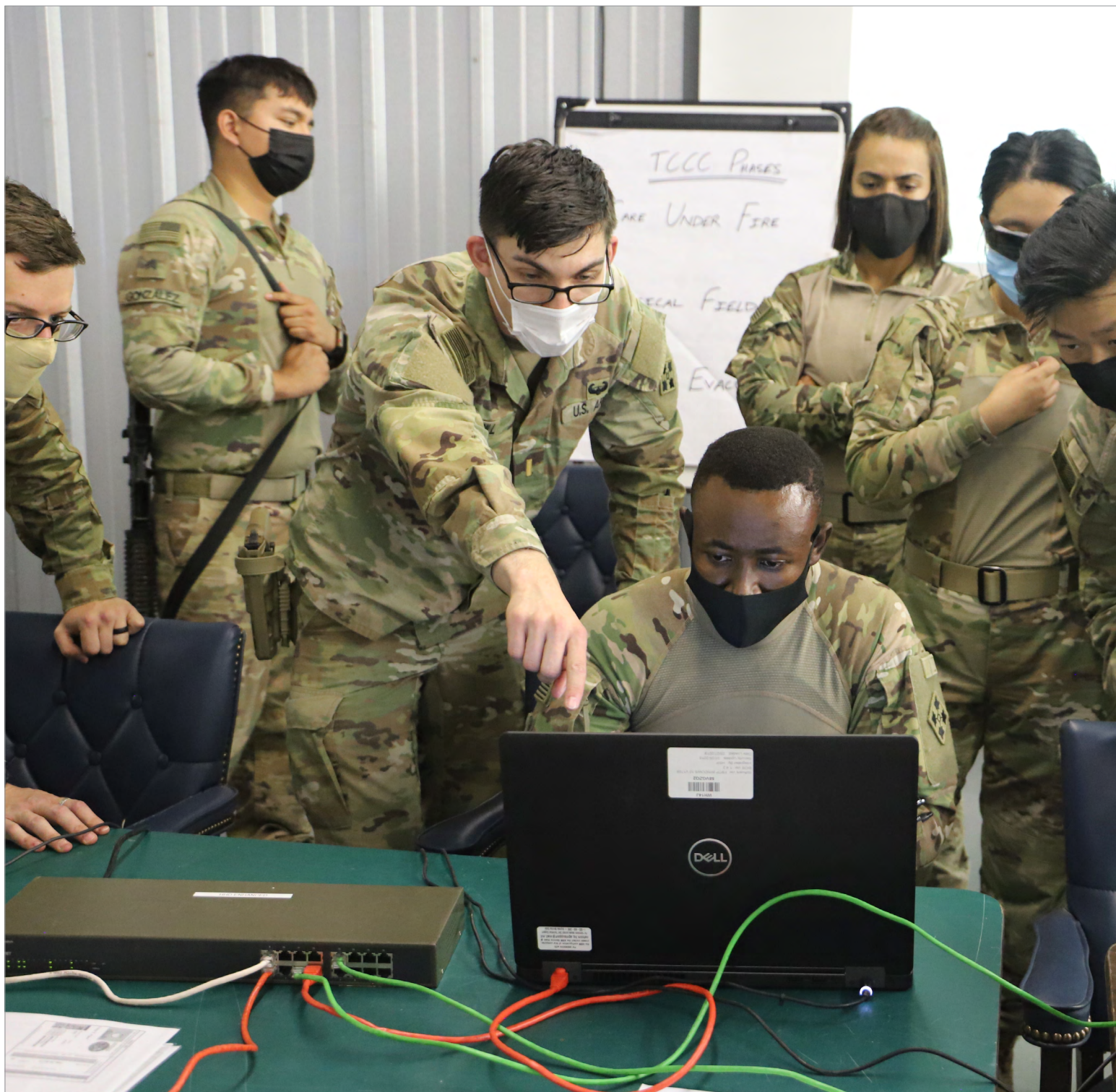
Soldiers with the Golden Eagles from the 230th Finance Management Support Unit, 4th Special Troops Battalion, conducted a field training exercise in August 2021.