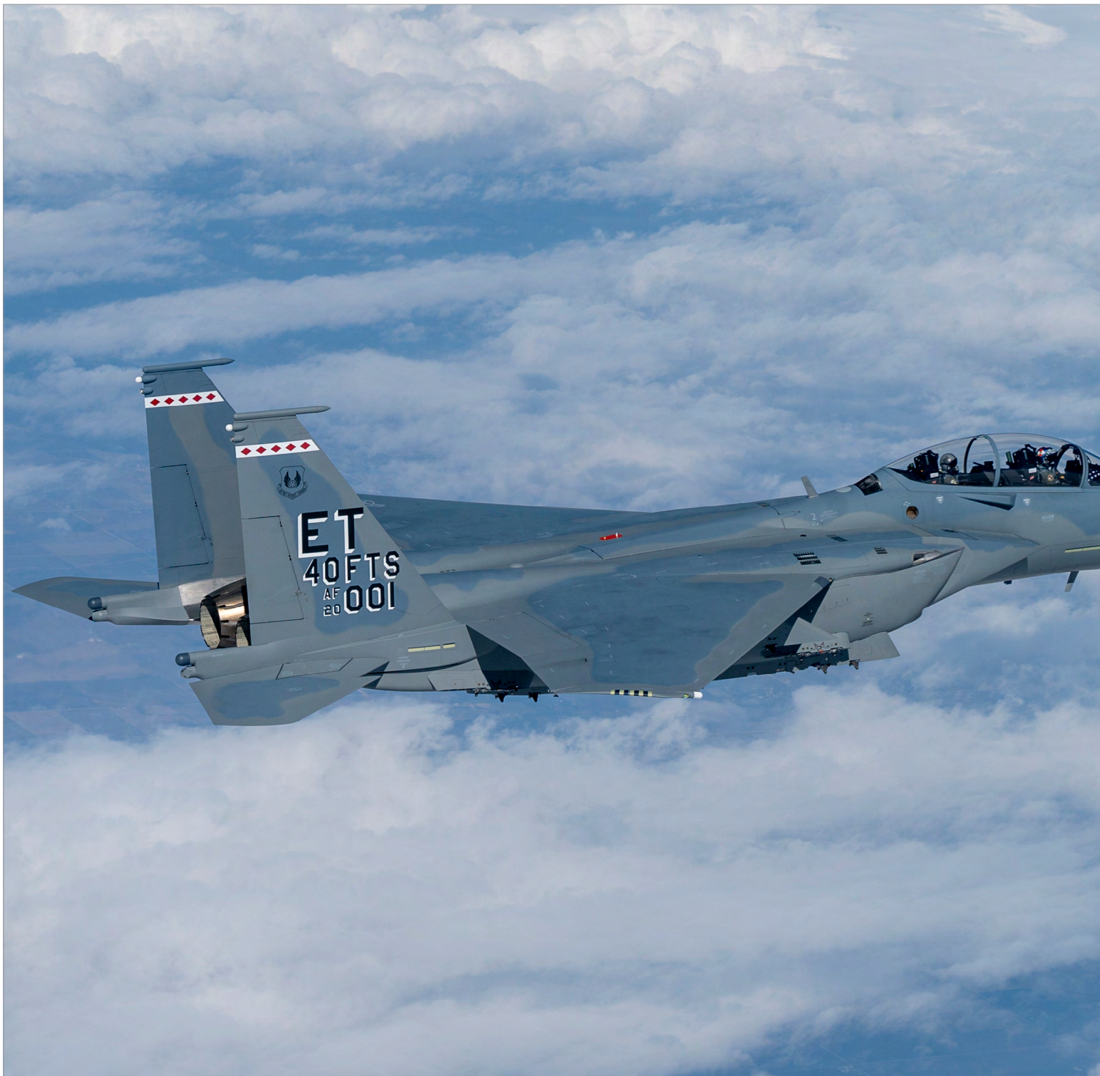
Airmen from the 40th Flight Test Squadron, and 85th Test & Evaluation Squadron, deliver the first F-15EX to its new home station, Eglin Air Force Base, Florida, on March 11, 2021.