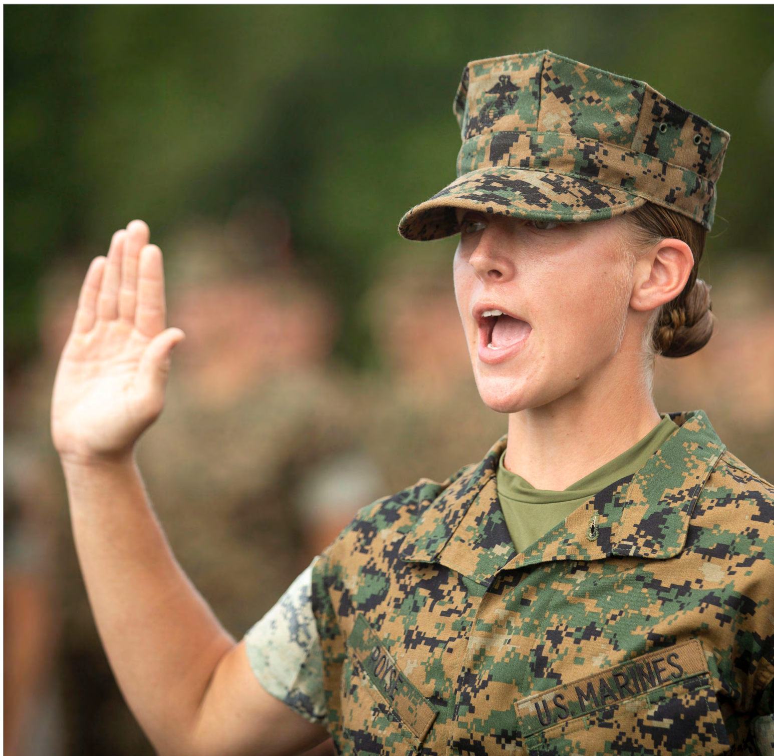
A Marine Corps officer candidate recites the Oath of Office, completing Officer Candidates School on Marine Corps Base Quantico, Virginia, on August 14, 2021.