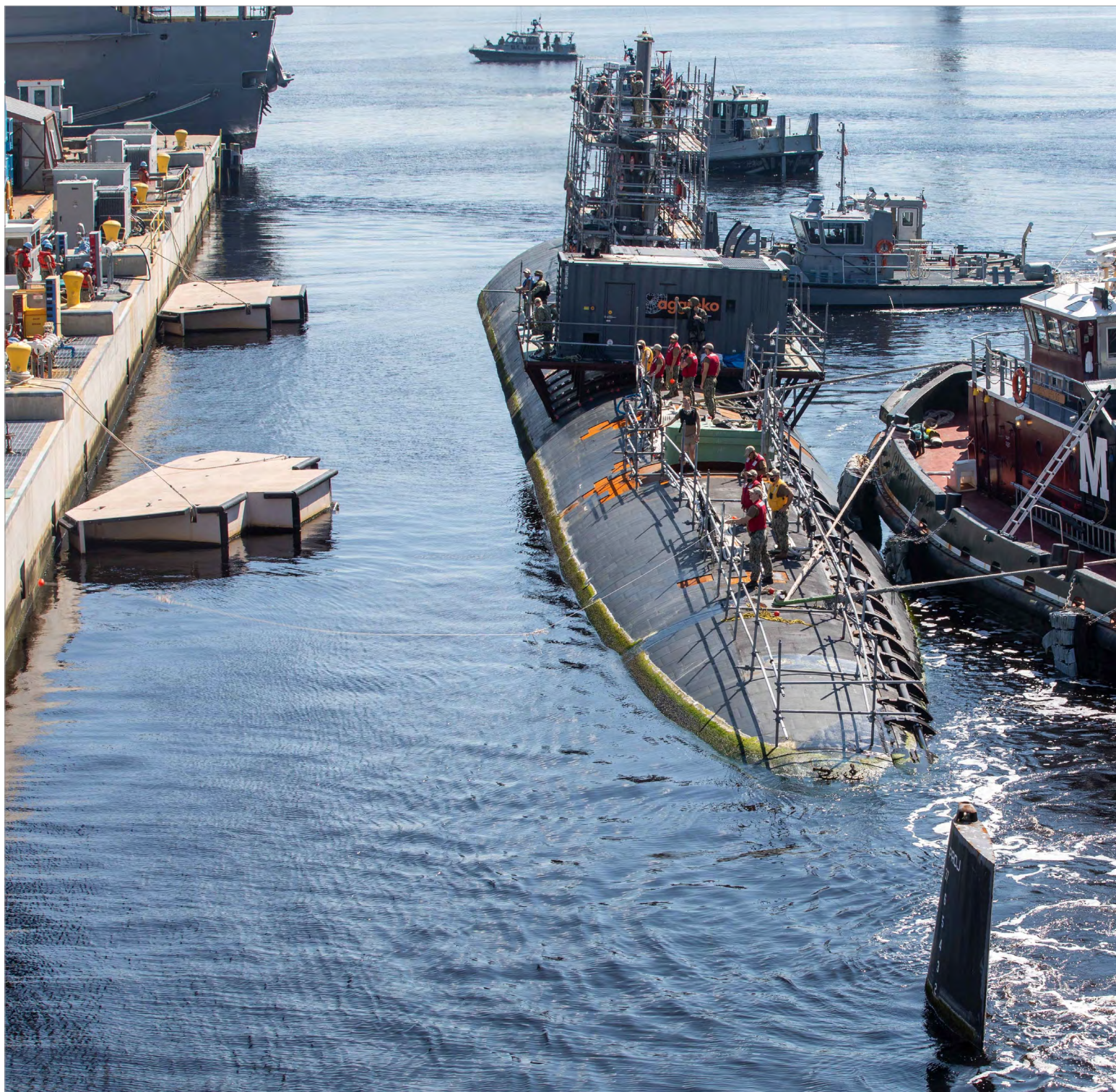
USS Pasadena (SSN 752) arrives at Norfolk Naval Shipyard on September 28, 2020, for drydocking to replace, repair, and overhaul boat components.