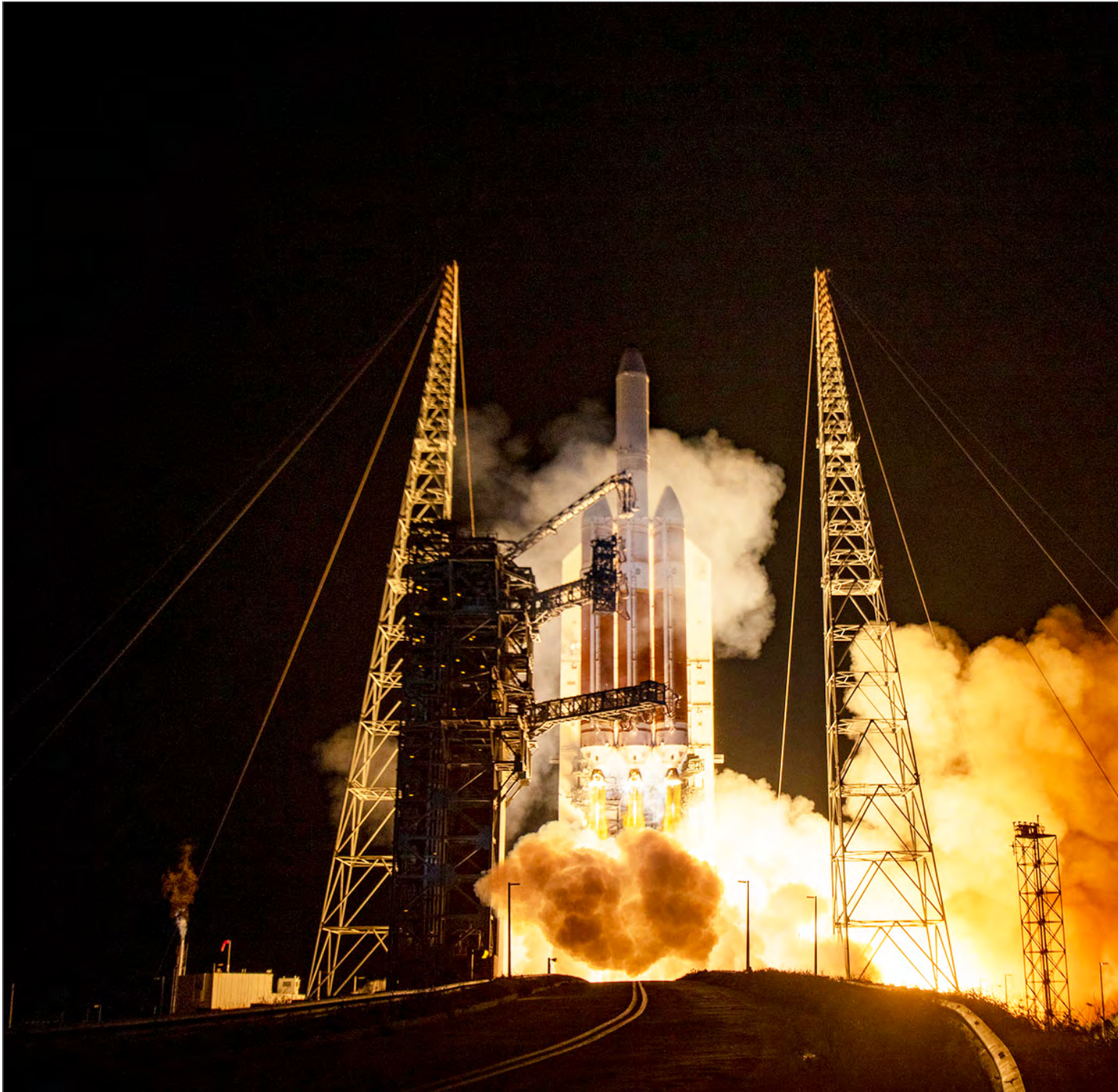
A Delta IV rocket launches from Cape Canaveral Space Force Station, Florida, on December 10, 2020.