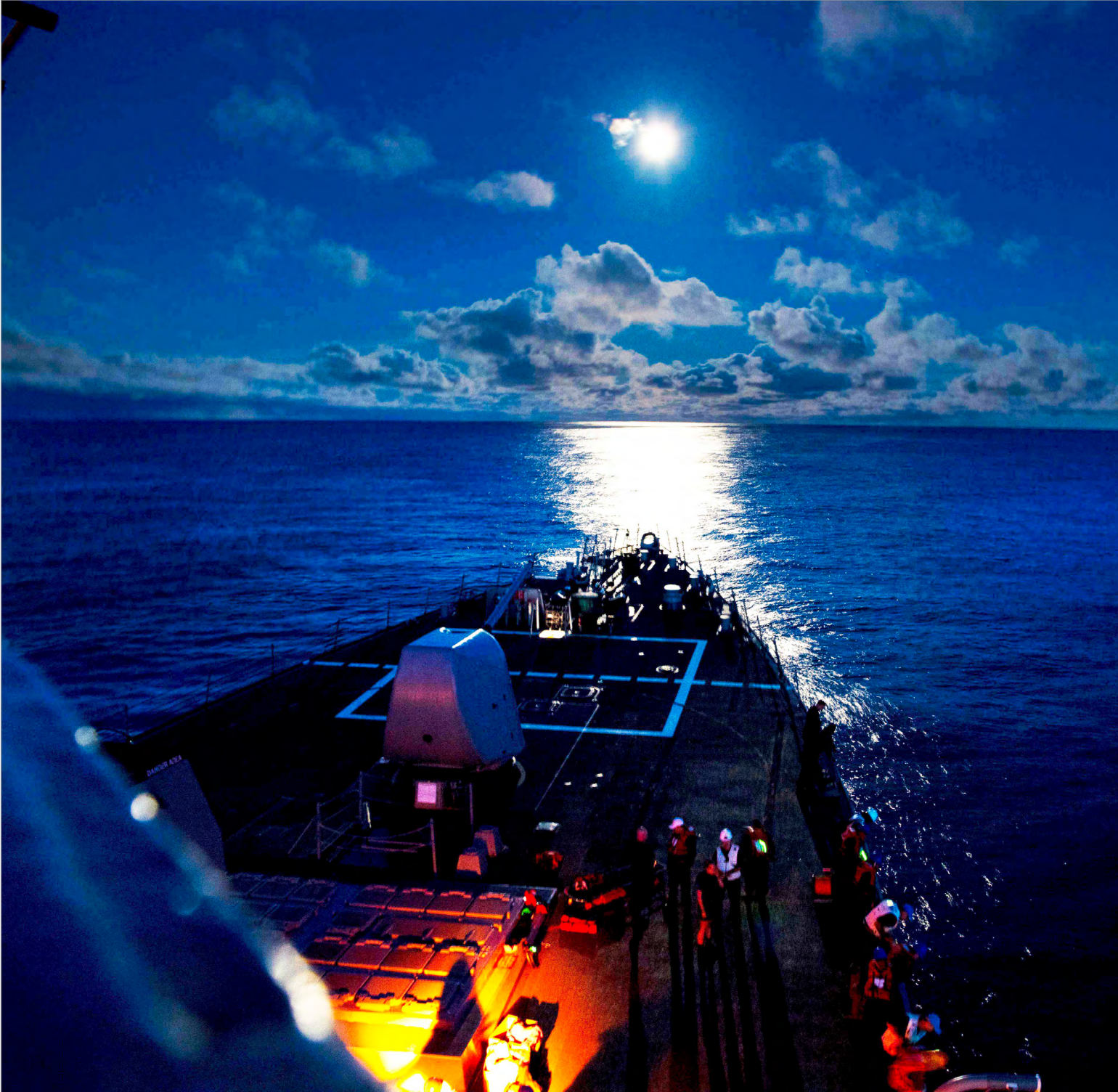
Sailors aboard Arleigh Burke-class guided-missile destroyer USS O'Kane (DDG 77) conduct a man overboard drill on June 23, 2021. The USS O'Kane was conducting routine maritime operations in the Pacific Ocean.