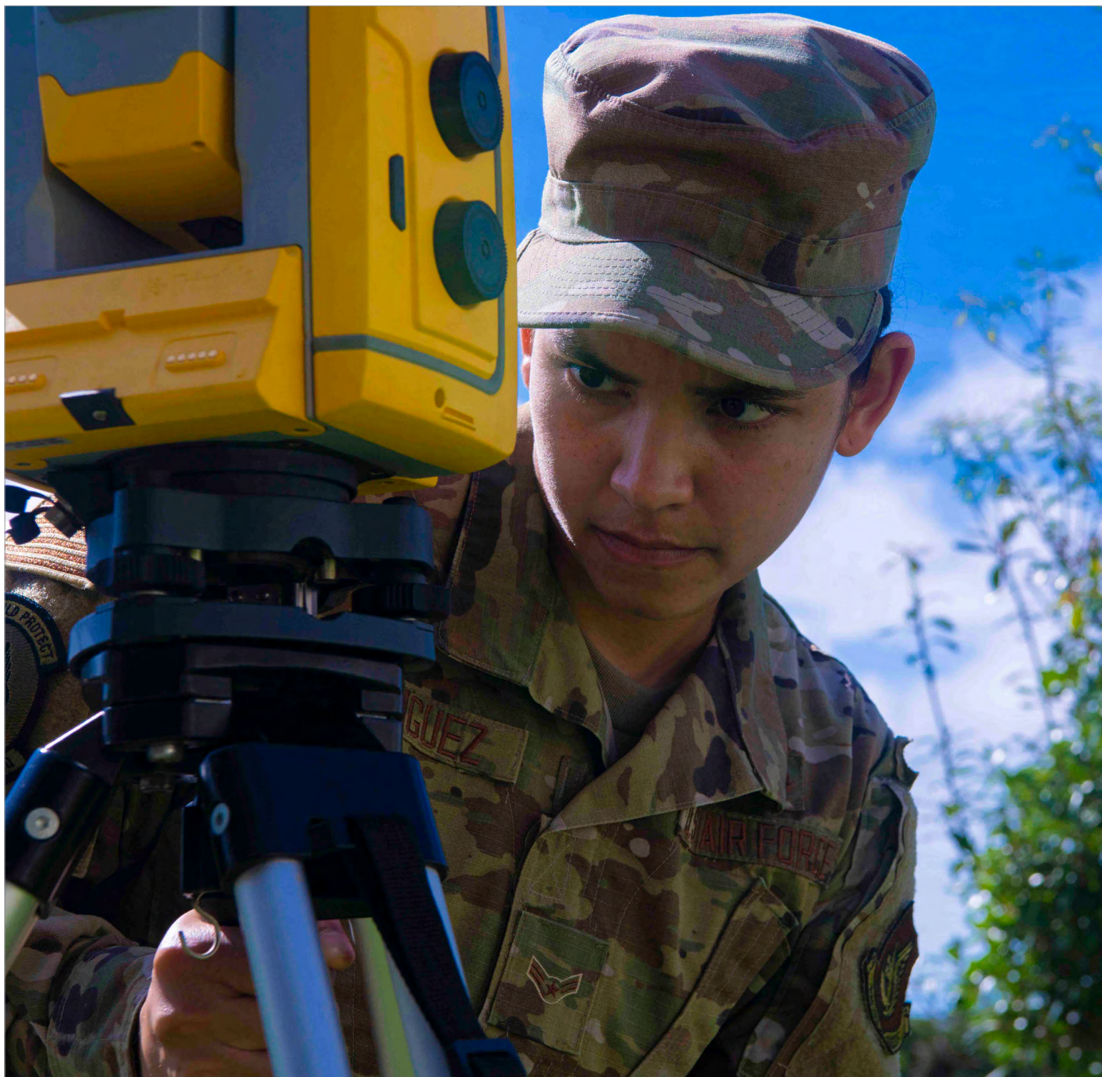
An Airman 1st Class, an engineering technician with 718th Civil Engineer Squadron, Execution Support, levels a Trimble S6 at Kadena Air Base, Japan, on June 9, 2021.