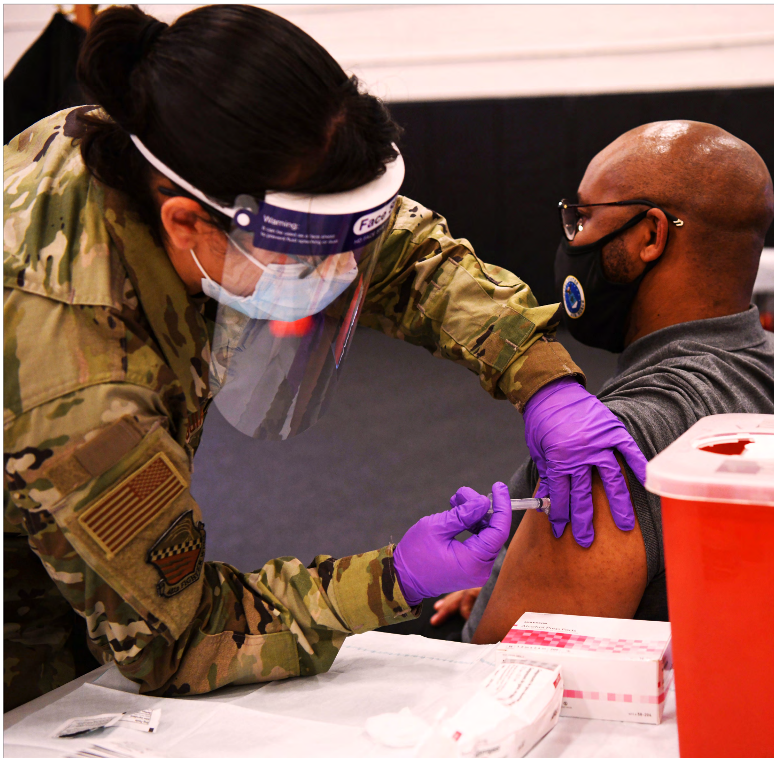
A member of team Homestead receives the coronavirus disease-2019 (COVID-19) vaccine at a vaccination event during the August Unit Training Assembly at Homestead Air Reserve Base, Florida, on August 7, 2021.