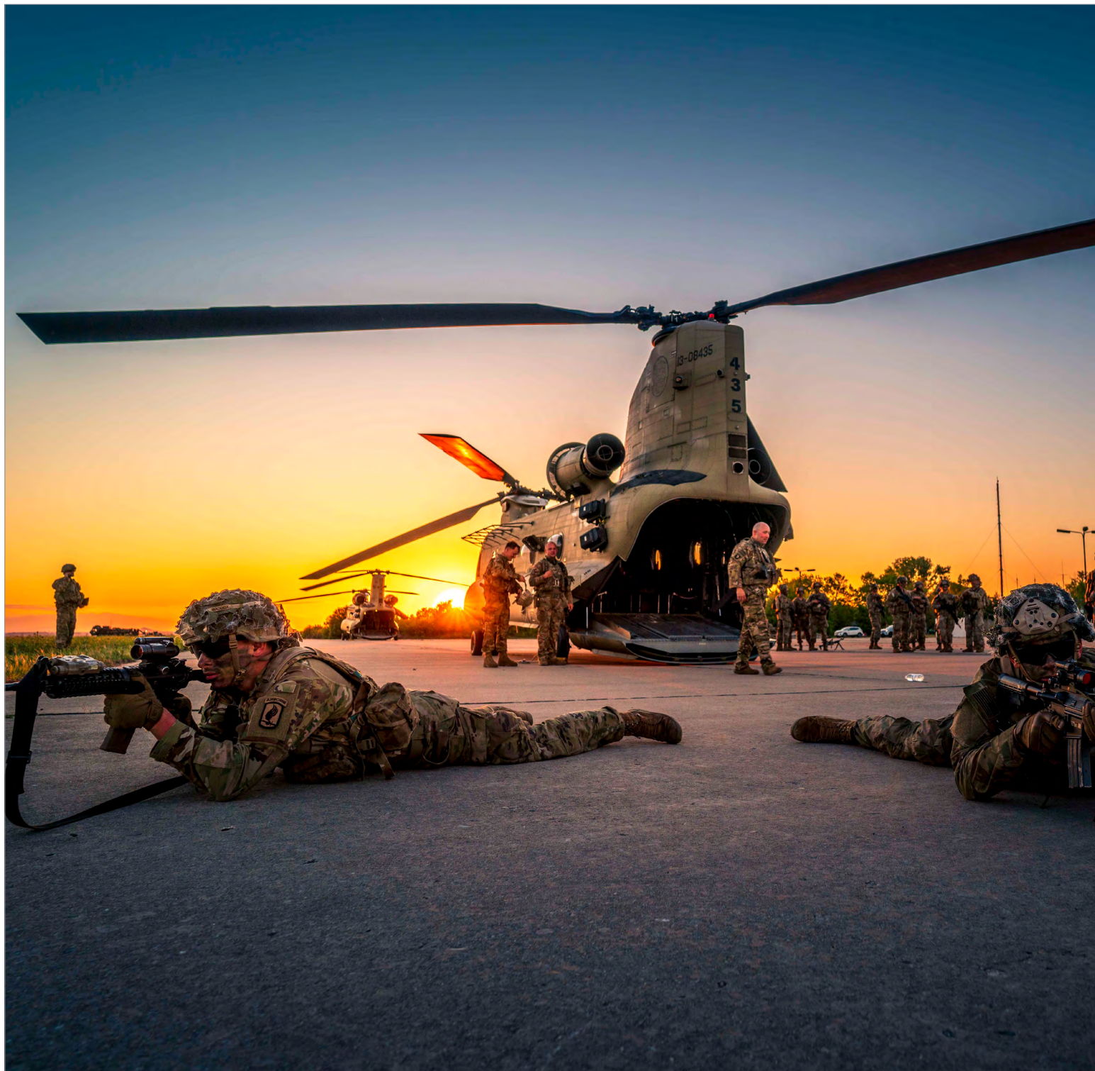
Soldiers from the 173rd Airborne Brigade rehearse exiting CH-47 Chinooks of the 12th Combat Aviation Brigade in preparation for night air assault missions during exercise Swift Response 21, part of the DEFENDER-Europe 21 series of exercises at Chech Airfield, Bulgaria, on May 11, 2021.