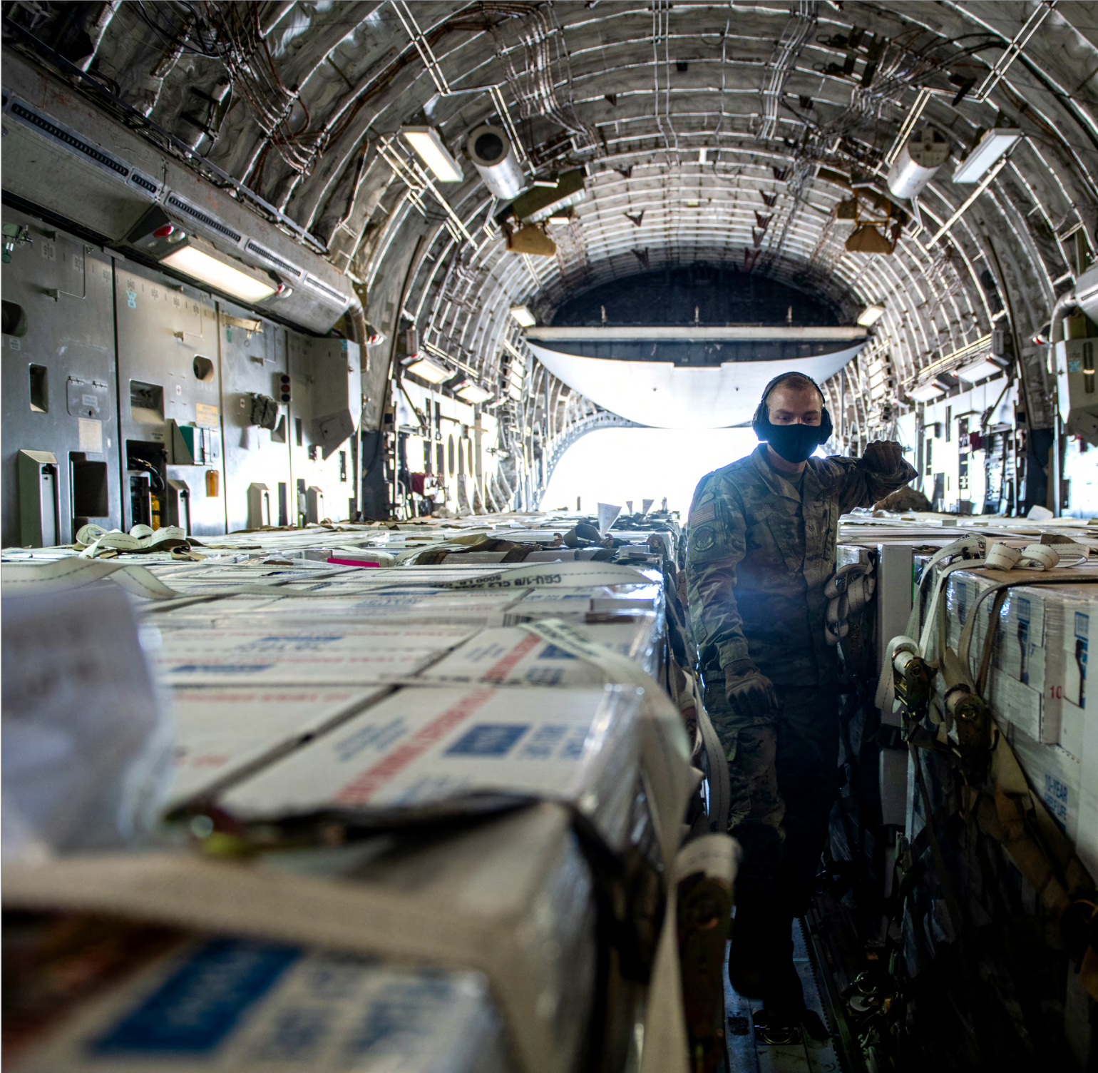
An Air Force Staff Sergeant, with the 821st Contingency Response Squadron at Travis Air Force Base, California, prepares to unload over 57,000 bottles of water, at Joint Base San Antonio-Kelly Field, Texas, to support the emergency response to Winter Storm Uri on February 21, 2021.