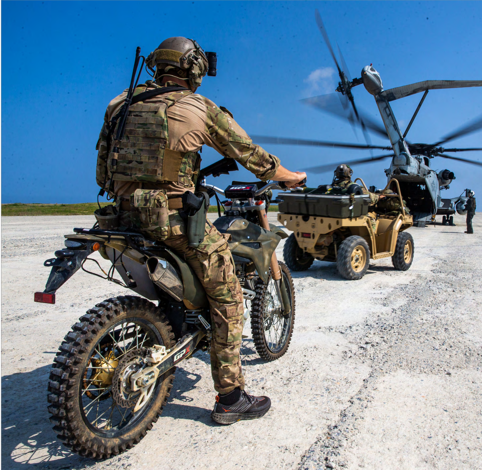
A Soldier with 1st Battalion, 1st Special Forces Group (Airborne), prepares to load a CH-53E Super Stallion with 1st Marine Aircraft Wing during Castaway 21.1 on Ie Shima, Okinawa, Japan, on March 17, 2021.