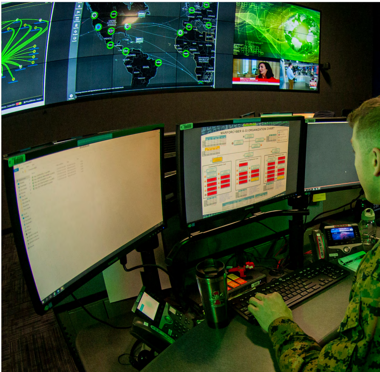
A Marine with Marine Corps Forces Cyberspace Command works in the cyber operations center at Lasswell Hall, Fort Meade, Maryland, on February 5, 2020.