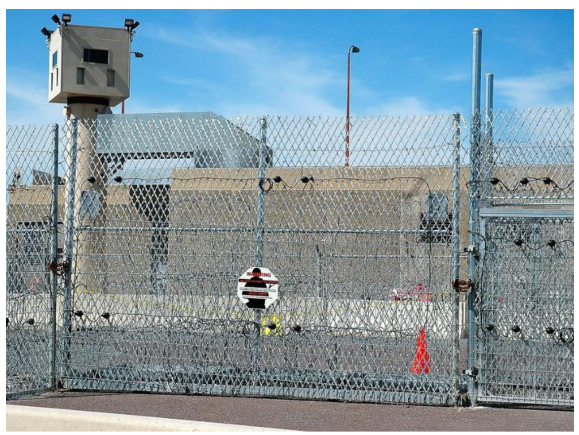
Figure 2: Security Barriers at a Nuclear Power Plant

Figure 2 shows security barriers, which are one of many security system elements that NRC staff inspect at nuclear power plants.