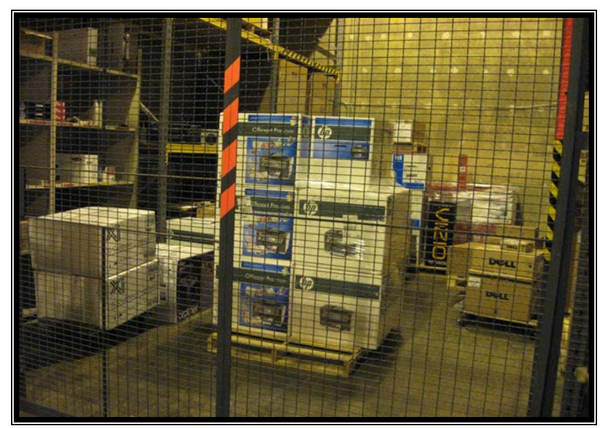
Photograph 1: Security lockup cage within the main NRC warehouse

The agency refers to its two warehouses as the main warehouse and the annex. NRC's main warehouse, the larger facility, is approximately 22,000 square feet and contains equipment, office furnishings, supplies, and systems furniture used to construct office workstations. This main warehouse also contains a security lockup cage with an open top (see the photograph below and on page 6) used to store sensitive property.<sup>2</sup>