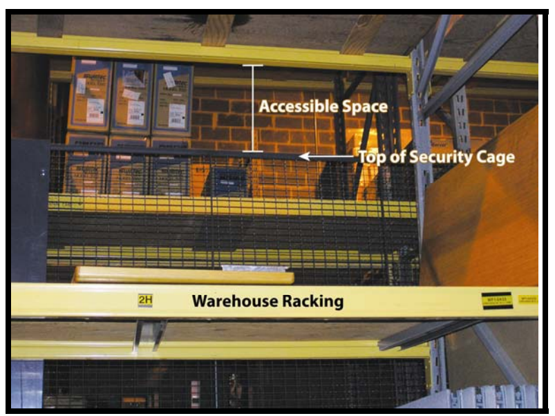
Photograph 2: Accessible space at the open top of the security lockup cage located within the main NRC warehouse

The annex does not have an intrusion detection system and a video surveillance system.