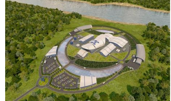
Artist rendition -- NuScale nuclear power plant (Image credit: NuScale Power)

NRC staff issued the final safety evaluation report for the NuScale small modular reactor design, completing the final phase of this review in August 2020. The NRC published a proposed rule in July