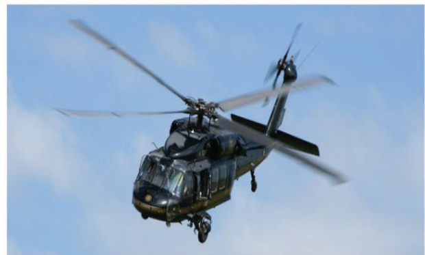
Figure 1. Photos of the MEA (Left) and the MLH (Right)