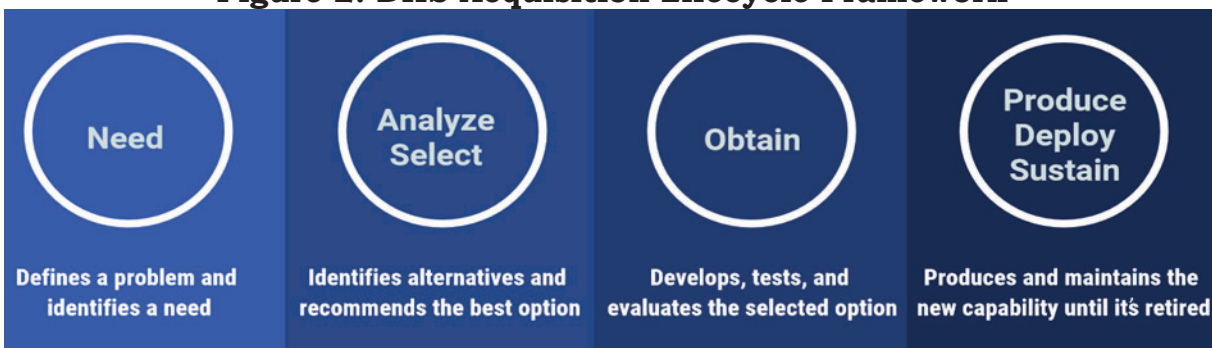
Figure 2. DHS Acquisition Lifecycle Framework