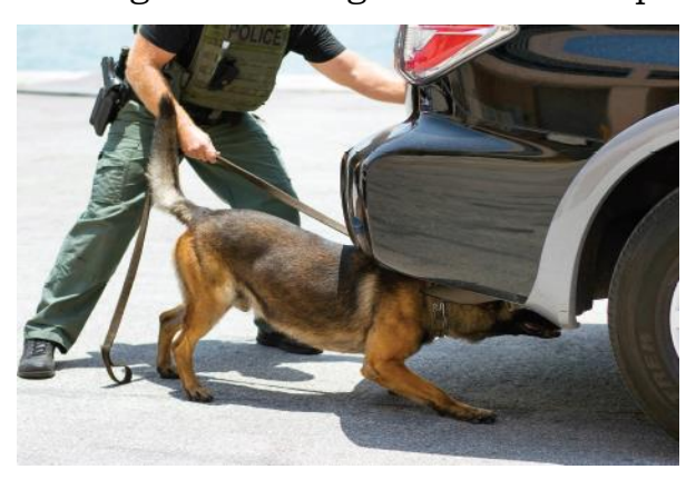
Figure 1. TSA Explosives Detection Canine Team

The NEDCTP has two types of Explosives Detection Canine Teams (EDCT) — Passenger Screening Canine and Explosives Detection Canine. Passenger