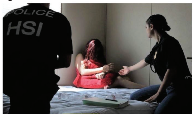
Figure 4. Victim Assistance Specialists