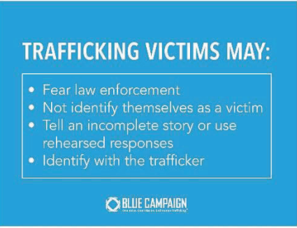
Figure 2. Challenges When Working with Victims

are essential for prosecution, which is made possible by the HTU and Victim Assistance Program. According to U.S. Department of Justice guidance,<sup>4</sup> the investigative agency's evidence, including information gathered during the investigation and case-related communications from victims, may be important to the ability of prosecutors to prosecute cases. Figure 2 identifies some of the challenges in working with trafficking victims.