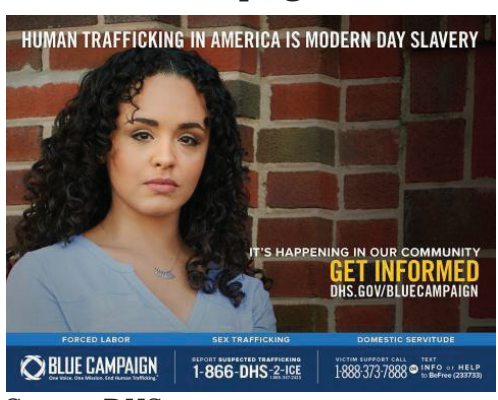
Figure 3: Blue Campaign Advertisement

We conducted this audit to determine the extent to which ICE identifies and tracks human traffic