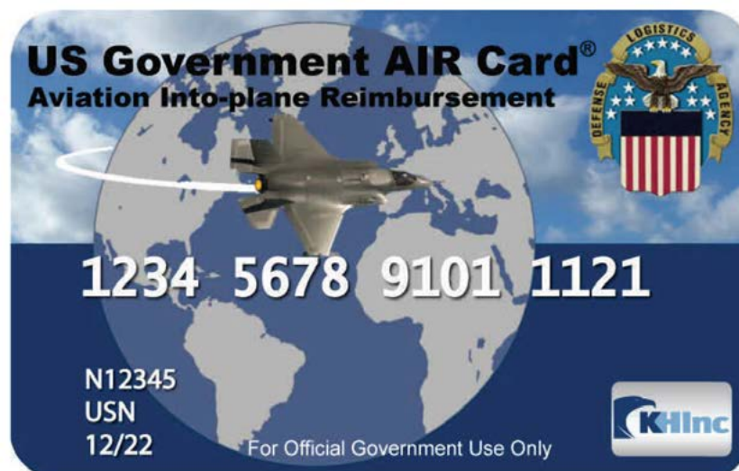
Figure 1. Example of a Government AIR Card

The AIR Card is a plastic card, similar to a commercial charge card, that Agency Program Coordinators (APCs) assign to a specific aircraft, rather than to an individual. There are also cards for any aircraft rather than a specific aircraft, and cards for fuel trucks in order to provide flexibility to AIR Card users. The AIR Card is accepted at DLA Energy contracted vendors and participating non-contract merchants. Whenever possible, AIR Card users are required to obtain fuel resources and related services from U.S. military bases. AIR Card policy requires that if commercial purchases are necessary, contract vendors take priority before non-contract merchants.