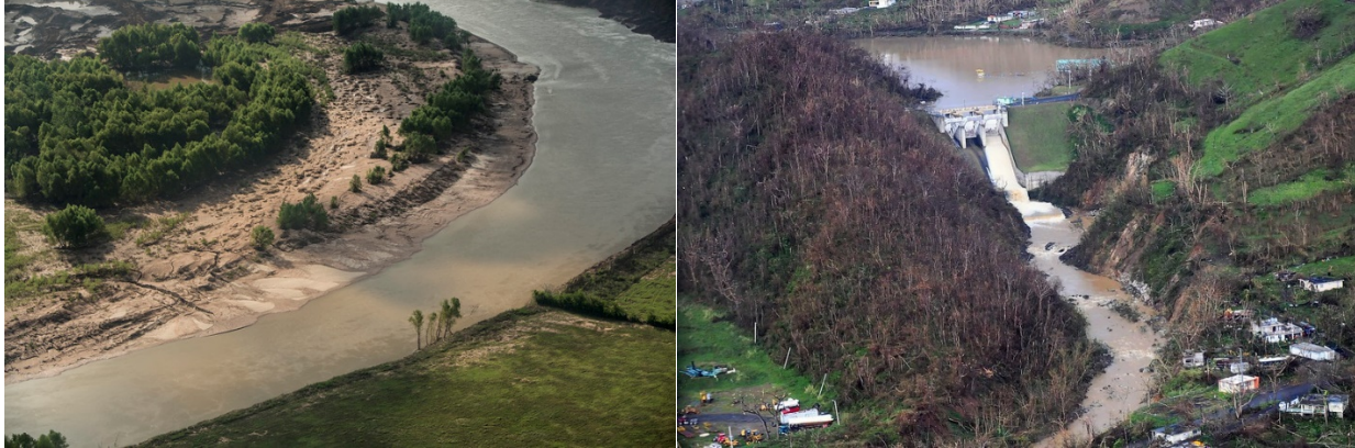
Figure 1: Hurricane flooding and destruction from Hurricane Harvey (left) and Hurricane Maria (right).

All EWP Program projects must be administered through a local sponsor or legal subdivision of State or Tribal governments. Eligible sponsors include cities, counties, towns, conservation districts, or any Federally-recognized Native American Tribe or Tribal organization. Project sponsors must: