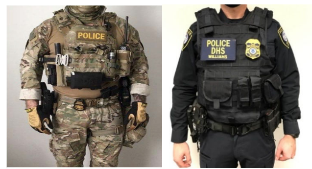
Figure 6. Example of Different Uniforms Worn By CBP and FPS Officers * CBP officer on the left and FPS officer on the right.

DHS officers deployed to protect Federal facilities in Portland did not wear consistent uniforms. Officers from FPS, CBP, and ICE all responded to Portland wearing their respective componentissued uniforms. See Figure 6 for an example of the different uniforms worn by CBP and FPS officers. During the operations, both citizens and Congress raised concerns regarding a lack of proper identification on officers'