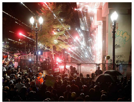
Figure 5. Example of Fireworks at the Hatfield USCH

Other officers said there were not enough less-lethal devices and munitions to respond effectively. Finally, officers also reported problems with radio communications, such as the inability to communicate with DHS officers from other components. Because of the communications issues in Portland, FPS requested 100 additional FPS radios. Despite identified equipment issues, many DHS officers stated that efforts to protect the facilities were effective.