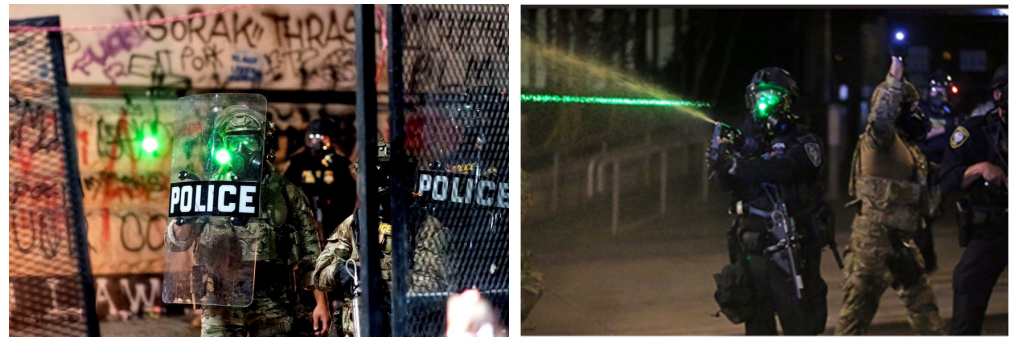
Figure 4. Laser Directed at Law Enforcement Officers

DHS officers did not have the necessary equipment to protect themselves during riots and violent protests in Portland. During the event in Portland, DHS officers were attacked with lasers, fireworks, and Molotov cocktails and struck by projectiles including frozen liquids, unknown chemicals, feces, and rocks. See Figure 4 for an example of a laser directed at officers. FPS' Standardized Operational Planning Process includes a checklist of equipment for critical incidents and special events, such as riot gear, riot baton, crowdcontrol shield, and certain less-lethal devices. However, some officers did not have shin guards, face shields, and protective eyewear when responding to the events in Portland.