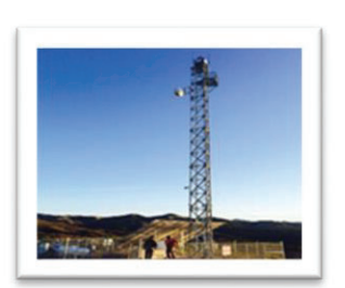
Table 1. Key Border Technology Systems

Integrated Fixed Towers (IFT) provide long-range, persistent surveillance of rural and remote areas. Each tower is equipped with sensors that continuously detect and track items of interest such as people crossing the border on foot or traveling in vehicles or low-flying aircraft, and provide that information to a Border Patrol command center.