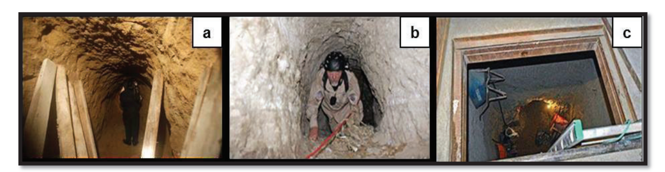
Figure 6. Examples of Cross-border Tunnels

Since 1990, Border Patrol has discovered approximately 190 cross-border tunnels through manual methods such as human observation of traffic patterns, law enforcement efforts, and routine patrol operations. Figure 6 shows: a) a sophisticated tunnel with lighting and ventilation; b) a rudimentary tunnel under the southwest border; and c) a clandestine tunnel that connects buildings in the United States and Mexico.