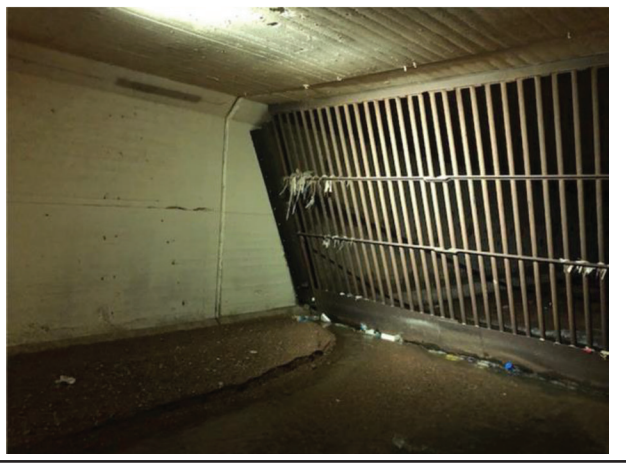
Figure 7. Examples of Tunnels Crossing the United States/Mexico Border

In September 2012, CBP established the formal operational need for tunnel detection technology,<sup>14</sup> but remained unable to implement an effective solution for field use. Nearly 7 years later, in January 2020, DHS approved the Cross-Border Tunnel Threat program, which Border Patrol described as a network of permanently-installed sensors to detect, classify, and localize subterranean activities. According to Border Patrol, the sensors will provide enhanced surveillance in areas where other technologies are hindered by terrain, foliage, or sustainability issues such as harsh climate conditions.