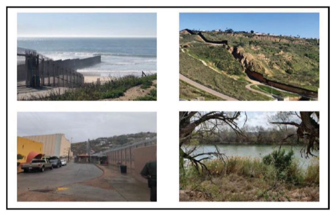
Figure 3. Southwest Border Environments

CBP also uses a variety of independent and standalone surveillance systems and tools to enhance situational awareness and increase agents' capability to observe and respond to illegal activities along the border. Commonly used systems and tools include fixed and mobile surveillance equipment, agent-centric devices, unmanned aircraft, and sensor detection systems and devices.