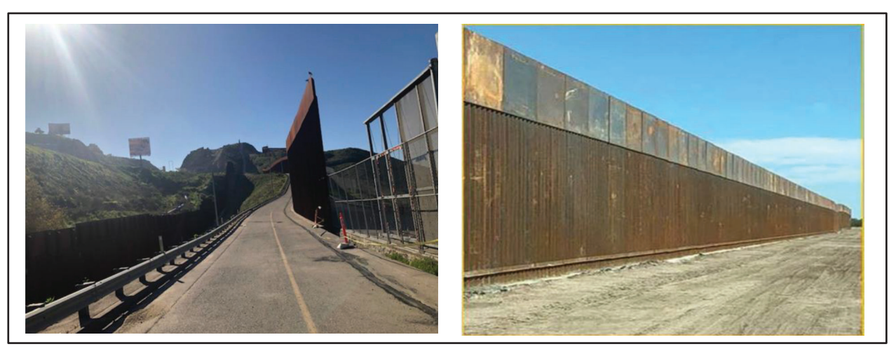
Figure 5. Border Wall Sections Recently Constructed in California and Texas

However, CBP did not meet its plan to deploy 40 miles of LGDS technology by the end of FY 2018. As of February 2020, only about 12 miles of LGDS equipment had been installed along the border wall. Figure 5 shows newly constructed border wall sections in California and Texas where LGDS will be installed.