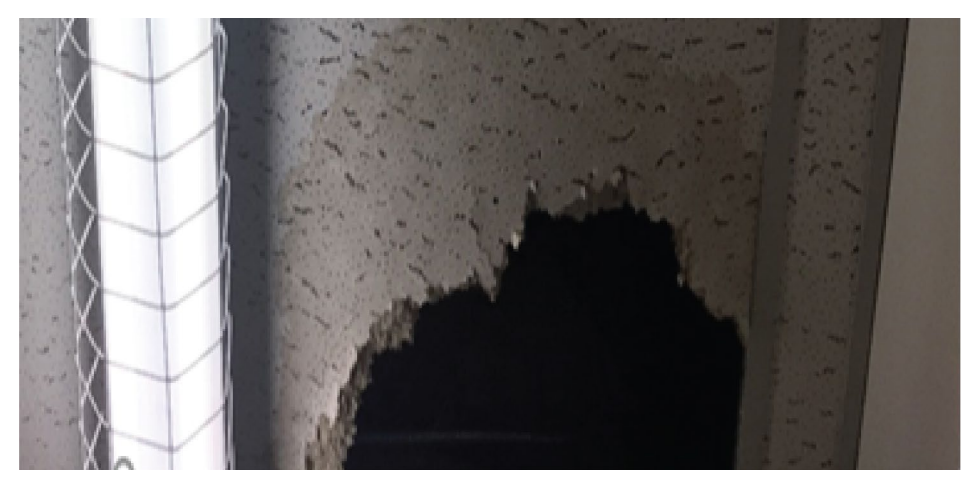
Figure 7. Damaged Ceiling Tile