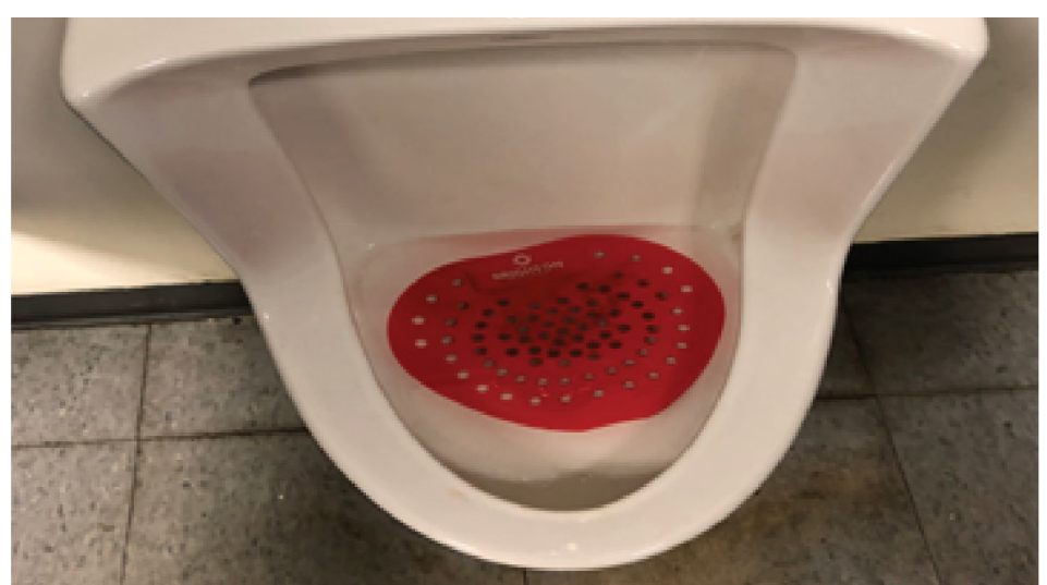
Figure 4. Semi-Operable Urinal in Men's Restroom