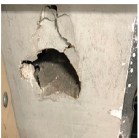
Figure 8. Damaged Walls in Workroom

In addition, we found damaged walls in the workroom (see Figure 8) and lobby areas and a damaged door closer at the lobby entrance (see Figure 9).