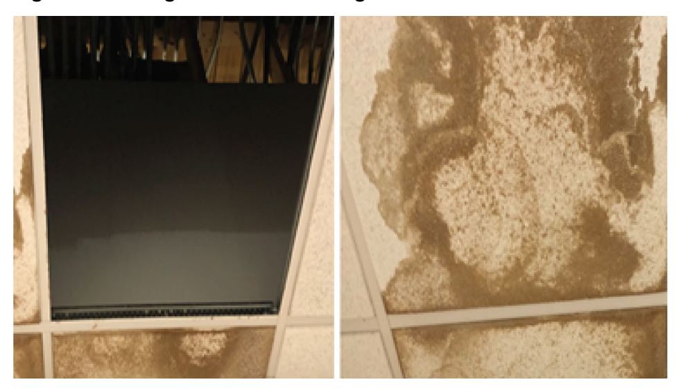
Source: U.S. Postal Service Office of Inspector General (OIG) photograph taken January 26, 2021.