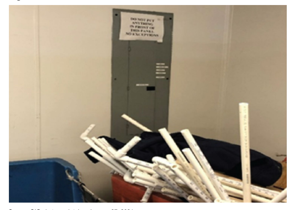
Figure 15. Blocked Electrical Panel