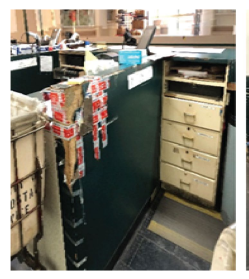
Figure 10. Damaged Window Clerk Counters