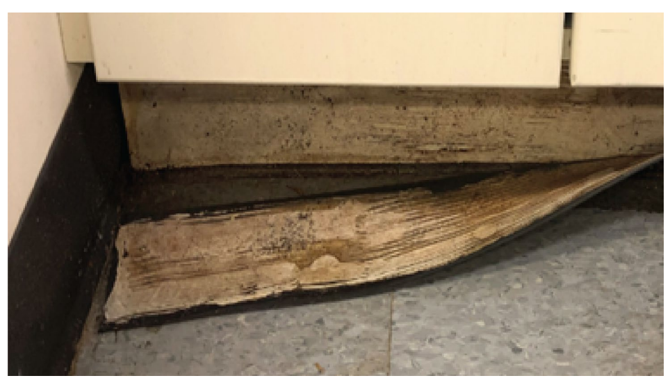
Figure 3. Partially Detached Baseboard Strip in Workroom