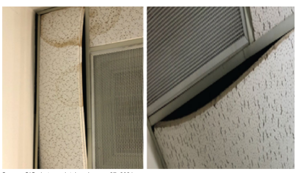
Figure 6. Bulging Ceiling Tiles