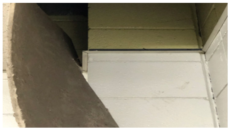
Figure 5. Hanging Ceiling Tile in Loading Dock