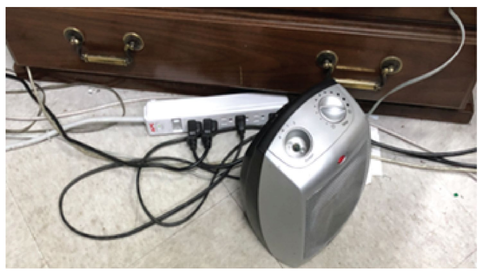
Figure 16. Portable Heater Plugged into Surge Proctector