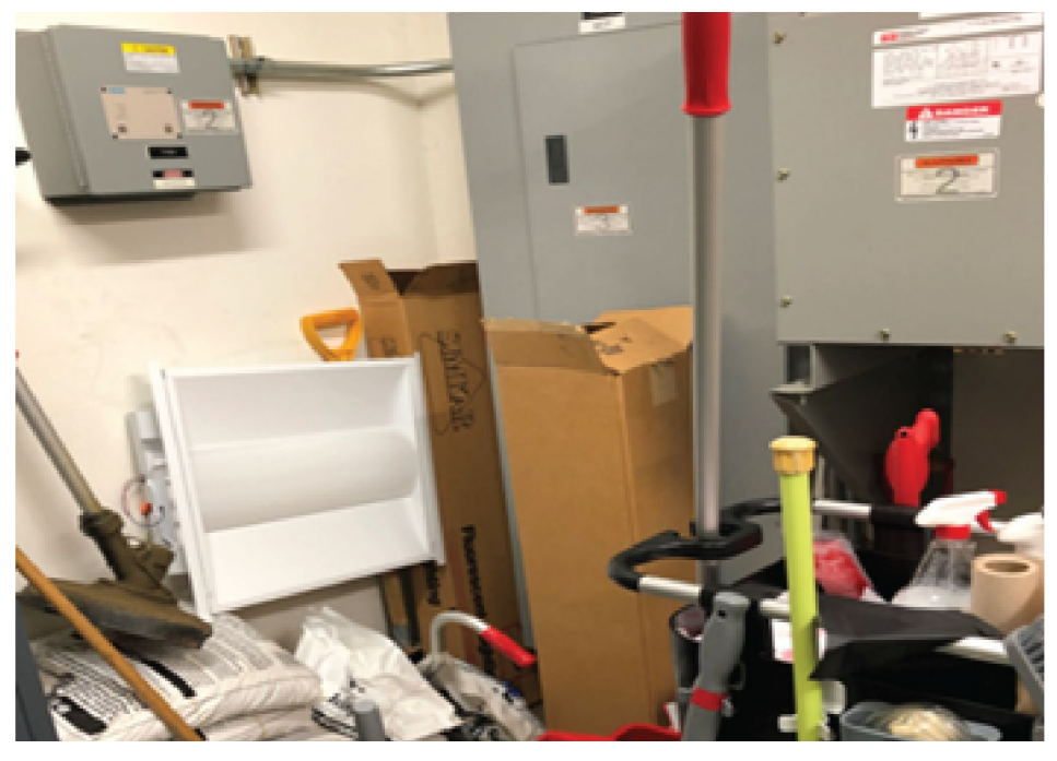
Figure 14. Blocked Electrical Panel