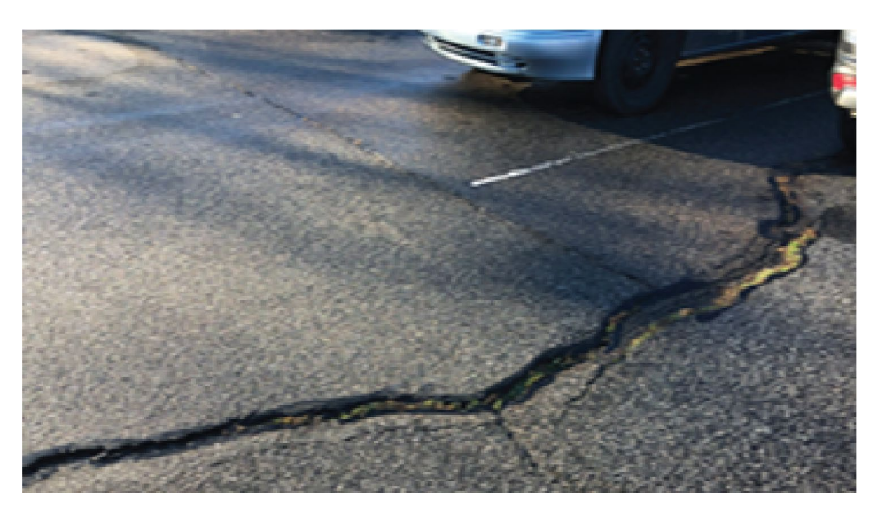
Figure 12. Cracked Asphalt