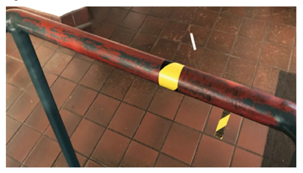
Figure 13. Faded Handrail