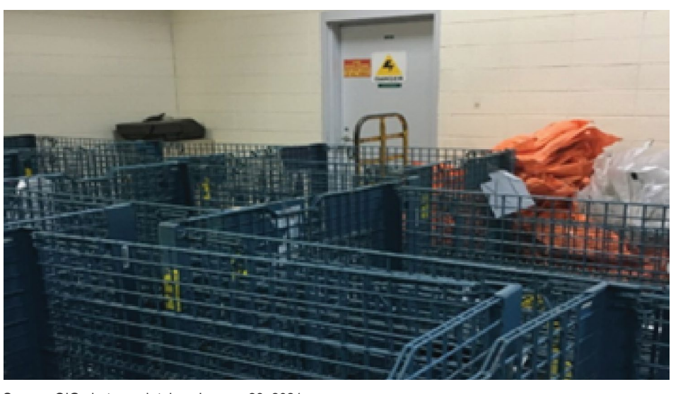
Figure 17. Excess Equipment Blocked Electrical Room Door