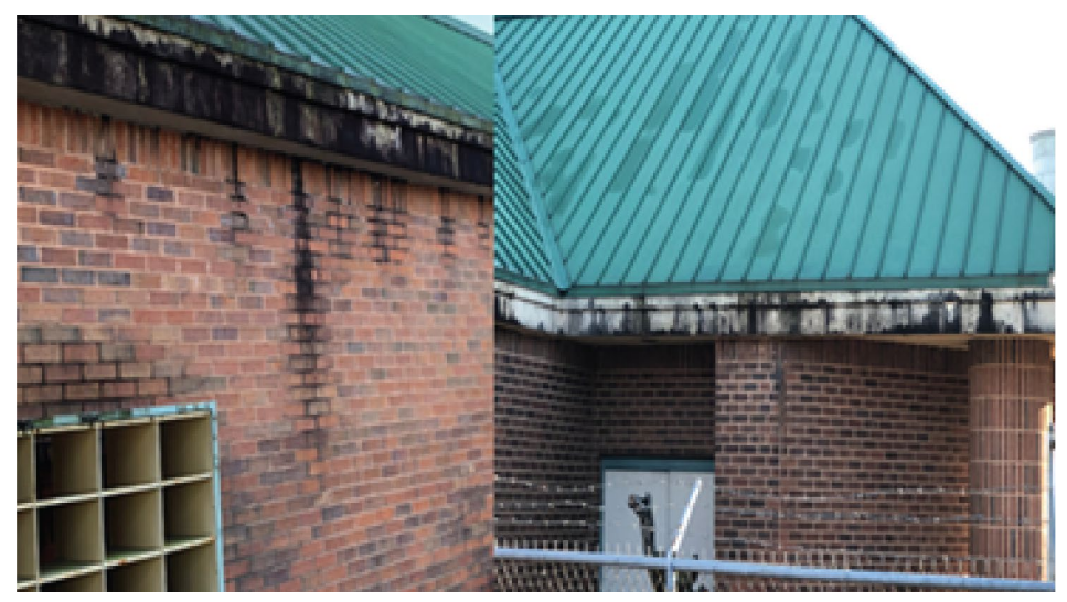
Figure 11. Dirty Exterior Trim at Rear and Sides of Building