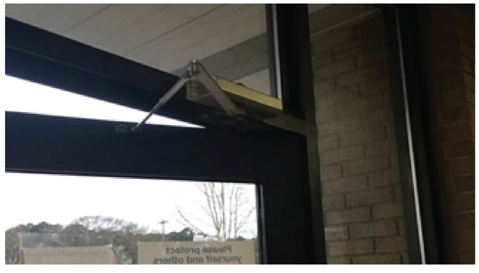
Figure 9. Damaged Door Closer at Lobby Entrance