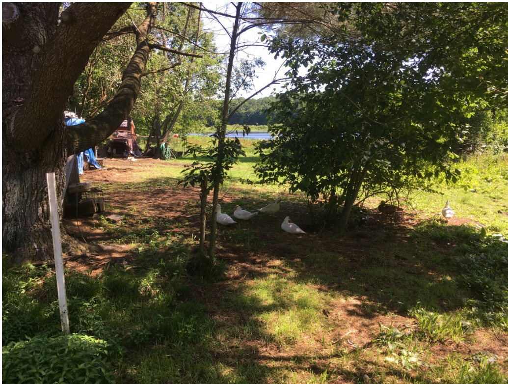
Photo 1: State Game Land (SGL) 214 livestock encroachment. The white stake on the left-hand side of the picture marks the game land boundary line, which runs almost straight up the picture from the stake.