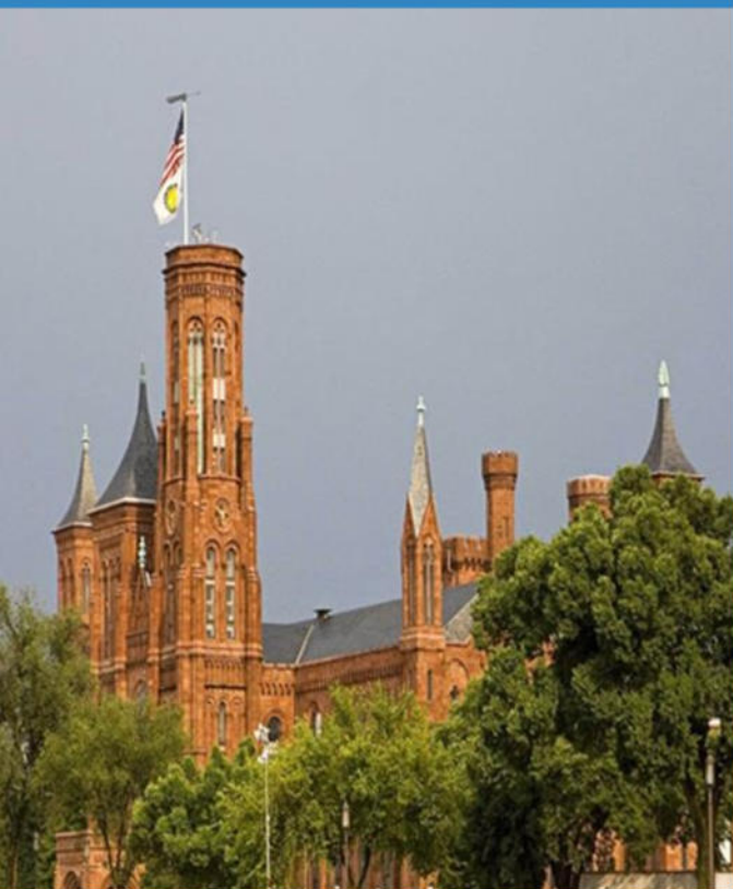
Smithsonian Institution Building (The Castle)