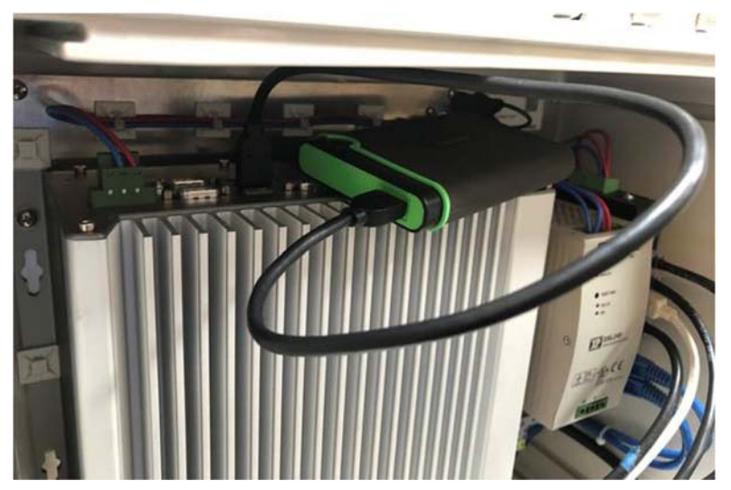
Figure 2. Perceptics' Data Transfer Set-Up Using an Unencrypted Hard Drive

According to documentation from Unisys and CBP, Perceptics subsequently admitted to Unisys that it had downloaded approximately 184,000<sup>17</sup> traveler images from the equipment in conjunction with the work order tickets. Perceptics personnel accomplished this using an unencrypted USB hard drive that was eventually transported back to their corporate office in Knoxville, Tennessee. This download set-up is depicted in figure 2. From there, subcontractor personnel uploaded CBP's images to a Perceptics server. According to documentation from a Unisys investigation, Perceptics downloaded images to improve performance.<sup>18</sup> CBP did not know of or authorize the subcontractor's removal of data and its subsequent storage on the subcontractor's network.