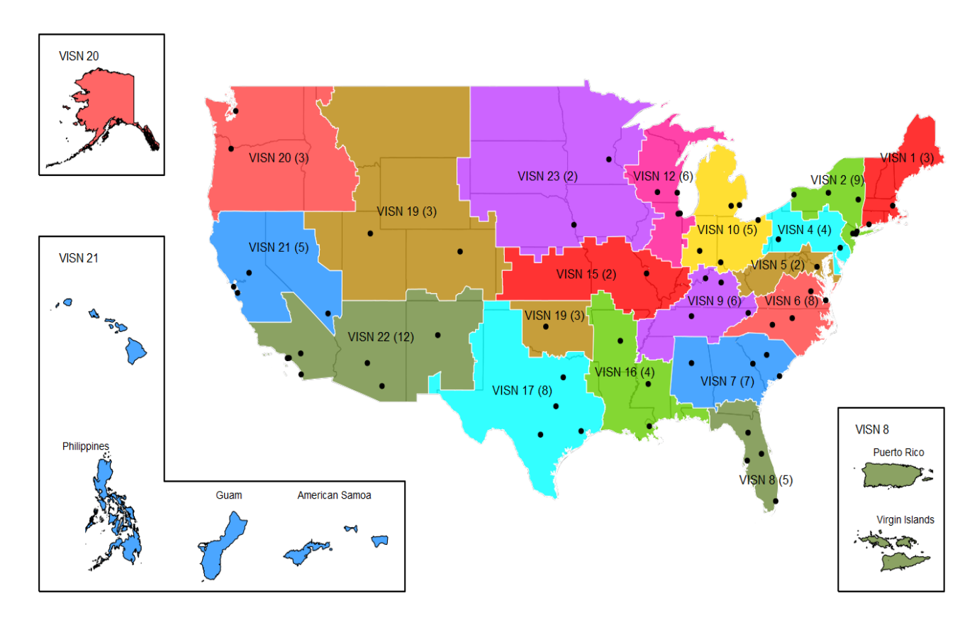
Figure 1. Geographic dispersion of robotic surgical systems across 18 VISNs in 2019. Note: The number of robotic surgical systems in a VISN is shown in parentheses. Some locations have multiple robotic surgical systems.

Figure 1 shows the locations of robotic surgical systems in use in 2019 by Veterans Integrated Service Network (VISN).