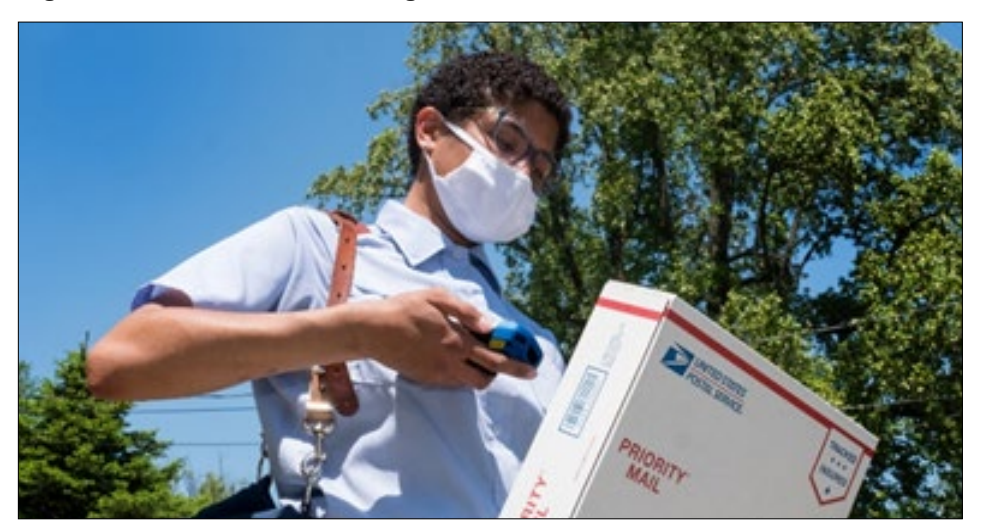
Figure 4: Letter Carrier Wearing a Mask

Just like the rest of the country, the outbreak of COVID-19 has impacted the Postal Service's employees and operations. Thousands of postal employees have tested positive for COVID-19 and some have even died. In addition, the coronavirus has altered some of the Postal Service's touchpoints with the public. For example, customer signature requirements are temporarily modified as postal employees verify customer names from a safe distance. Mail carriers and other postal employees are required to wear masks or other face coverings in states or local jurisdictions that require them. The Postal Service also implemented safety measures in post offices, including plastic "sneeze guards" at windows and a social distancing requirement so that customers do not line up too closely to each other. In addition, the Postal Service announces service and facilities impacts on its public website so customers can see whether operations in their area are affected by the current spread of the coronavirus.<sup>28</sup>