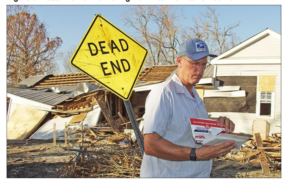
Figure 3: Letter Carrier Delivering Mail After Hurricane Katrina

The storm had displaced a million people in states along the Gulf. The Postal Service used its Address Management System (AMS) database and change of address system to help FEMA locate displaced families and distribute information on disaster assistance programs. At the Houston Astrodome, where thousands of displaced families took shelter, the Postal Service set up a unique ZIP code to help facilitate communications. USPS also made radio announcements providing people with instructions on how to submit a change of address. To help survivors maintain communications, the Postal Service set up emergency post offices at temporary shelters. In addition, it coordinated special delivery of disaster assistance checks.<sup>26</sup>