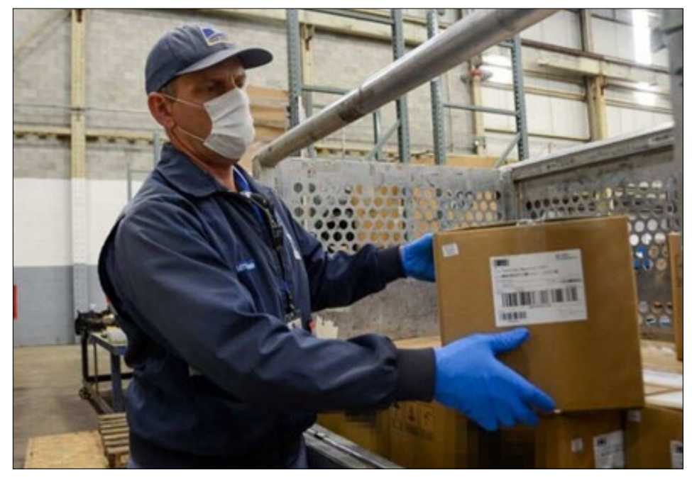
Figure 6: Postal Worker Loads Boxes of PPE at FEMA Facility

(Note: The OIG modified this image to blur out a corporate logo.)