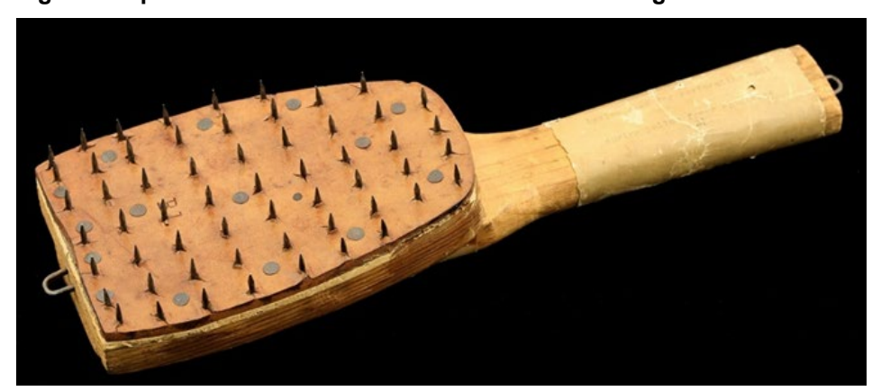
Figure 1: Spiked Paddle Used to Perforate Mail for Fumigation