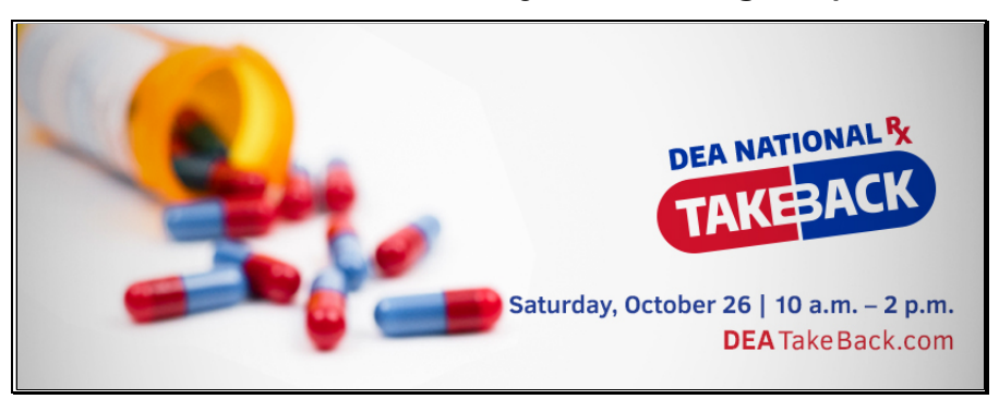
Figure 2 2019 DEA Take Back Day Advertising Graphic