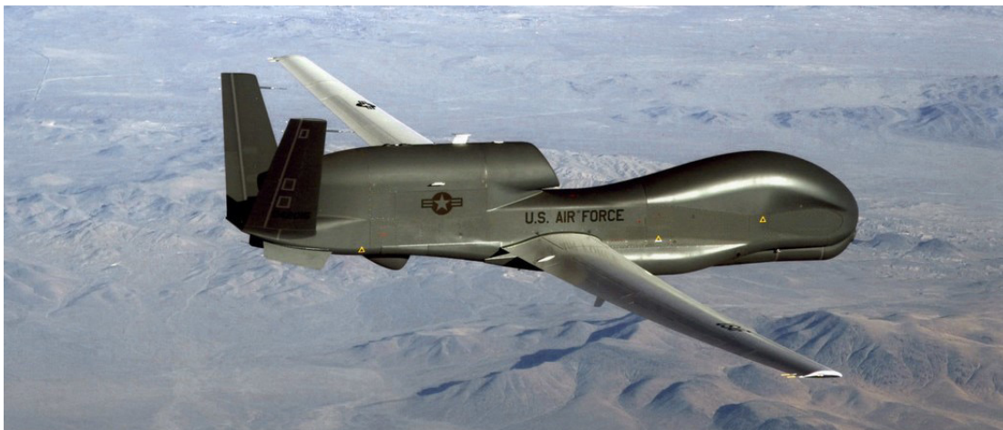
Figure 2. RQ-4 Global Hawk

The RQ-4 provides global all-weather, day or night intelligence collection. The RQ-4 provides persistent near-real-time coverage using imagery intelligence, signals intelligence, and moving target indicator sensors. Figure 2 shows an RQ-4 in flight.