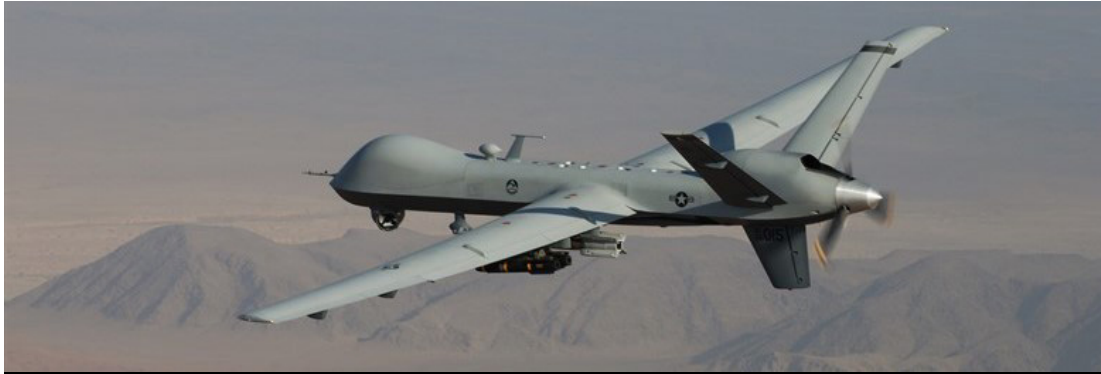
Figure 1. MQ-9 Reaper