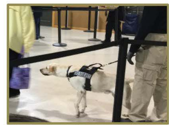
Figure 1: Passenger Screening Canine

explosive odors using a canine's sense of smell. Once a canine detects an odor, it exhibits a change of behavior, which is interpreted by a handler who then conducts a search to identify the source of the odor. Figure 1 shows a canine in training. According to DHS officials, TSA added PSC teams at checkpoints in response to the Christmas day 2009 bombing attempt by a male traveler who concealed an explosive in his clothing, but failed to detonate it during the flight.