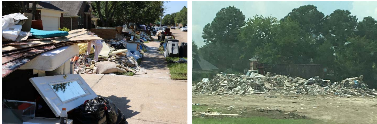
Figure 1: Storm Debris from Hurricane Harvey in Harris County, TX

Harris County (County) is in the southeast region of Texas and has about 4.7 million residents. Hurricane Harvey struck the Texas Coast as a category four hurricane on August 25, 2017. Tremendous rainfall occurred across much of Harris County, which caused flash flooding. The President declared a major disaster on August 25, 2017. See Figure 1 for photos of storm debris from Hurricane Harvey in the County.