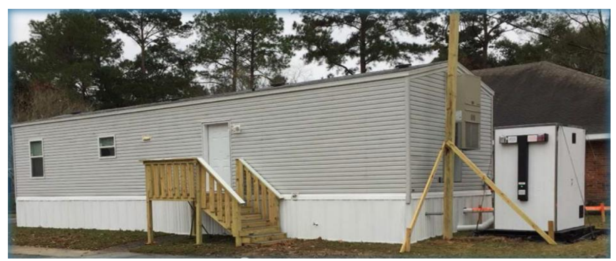
Figure 1: FEMA MHU with a TPS Attached to Operate the Fire Sprinklers

FEMA keeps its new inventory of MHUs at two permanent storage sites — one in Cumberland, Maryland, and the second in Selma, Alabama. FEMA also used two temporary staging areas in Beeville and Hearne, TX to store MHUs during and after Harvey.