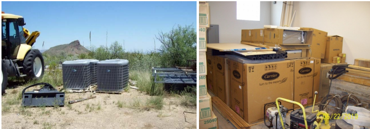
Figure 1: Unused HVAC Units Outdoors and in a Warehouse in 2019

In FY 2013, park officials purchased 4 HVAC units costing a total of $27,426, and in FY 2014 the park purchased an additional 18 units costing a total of $112,691. These units, purchased 5 to 6 years ago, have sat unused in various indoor (warehouses) and outdoor (open lots) locations around the park, despite the project's purchase justification, which states, "the extreme temperatures and sunlight exposure necessitate regular replacement of the heating and cooling systems." See Figure 1.