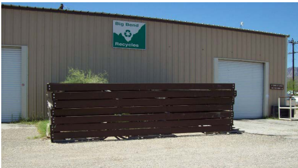
Figure 2: Shade Shelter Frames in 2019 Still Uninstalled Since FY 2015

Park staff purchased the shelters in FY 2015 and marked the overall rehabilitation project as completed in FY 2018. The PMIS completion description included the statement that “[n]ew shade structures and picnic tables were purchased,” with no mention that the materials for the structures were in bundles on the ground rather than installed as planned (see Figure 2). The former superintendent digitally signed off on the completion report in the PMIS, but there is no indication of further oversight. While the shade shelters are intended for outdoor use and as such may still be usable, they cannot fulfill their intended purpose of protecting visitors from harsh weather conditions until installed.