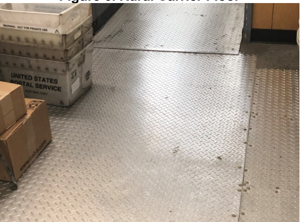
Figure 6. Rural Carrier Floor

At the Greenfield Post Office, sections of the rural carrier floor were buckling and had metal plates causing a trip hazard (see Figure 6). In our 2016 Great Lakes Area audit, we identified a missing section of the rural carrier floor. Management installed sections of metal plates to address the issue; however, the metal plates flex and are uneven.