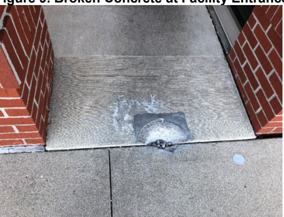
Figure 9. Broken Concrete at Facility Entrance

facility (see Figure 9). This was previously reported in eFMS in April 2018, February 2019, and September 2019, and remained an issue at the time of our review.