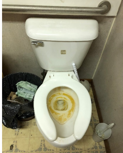
Figure 5. Dirty Restroom at the Maxwell Post Office