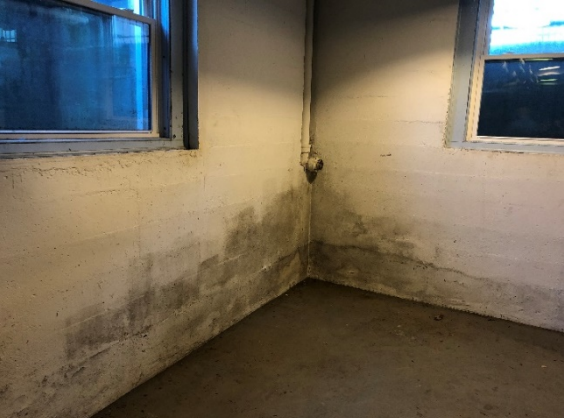
Figure 7. Potential Mold on Basement Wall