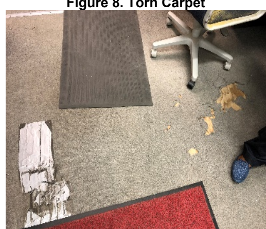
Figure 8. Torn Carpet

At the Maxwell Post Office, one fire extinguisher was missing both annual and monthly inspections, the floor was uneven, and sections of the carpet were torn, causing a tripping hazard (see Figure 8).