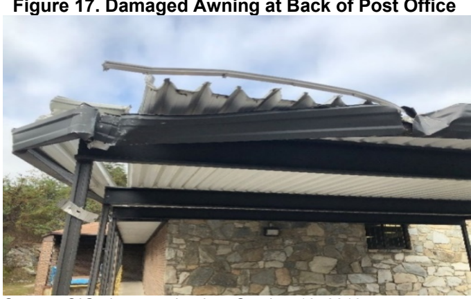
Figure 17. Damaged Awning at Back of Post Office

The Clyde Post Office had a damaged awning in the back of the facility. The Postmaster indicated that an Amazon truck hit the awning and weakened the base, posing a safety hazard if not replaced. The incident occurred on September 14, 2019 and was reported in eFMS on October 2, 2019. As of the date of this report, the work has not been completed (see Figure 17).