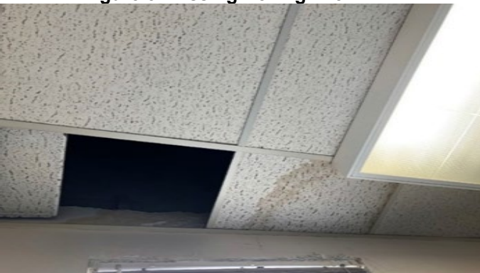
Figure 5. Missing Ceiling Tile

Source: OIG photograph taken October 9, 2019. Source: OIG photograph taken October 9, 2019.