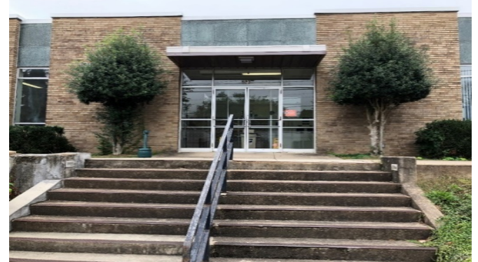
Figure 6. Covered Post Office Signage

There was overgrown shrubbery covering Waynesville Post Office signage, making it difficult for customers to identify the name of the facility (see Figure 6).