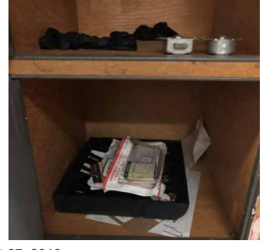
Source: OIG photograph taken at the Greenpoint Station on August 27, 2019.

These conditions occurred because employees did not follow established procedures that would have ensured the items were secured. According to Postal Service Handbook F-101, Field Accounting Procedure, the field unit manager or supervisor must provide adequate security for all accountable items. Accountable items include postal funds, stamp stock, blank money order stock, philatelic products, retail products, accountable receipts, and imprinters.