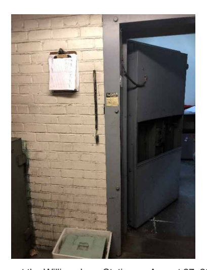
Figure 9. Key to Deposit Compartments in Vault at the Williamsburg Station