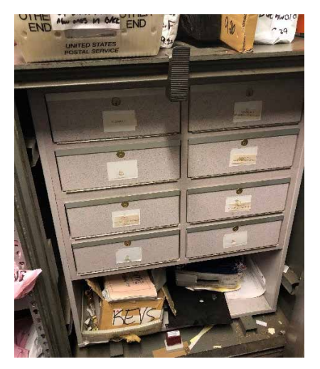
photographs taken at the Williamsburg Station on August 27, 2019.