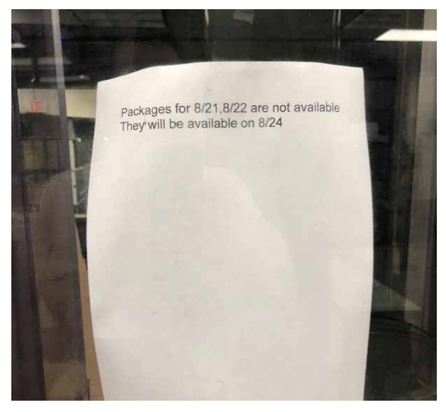
Figure 6. Notice in the Lobby at the Williamsburg Station