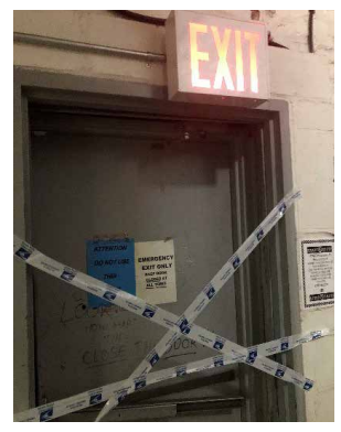
Source: OIG photographs taken at the Williamsburg Station on August 27, 2019.