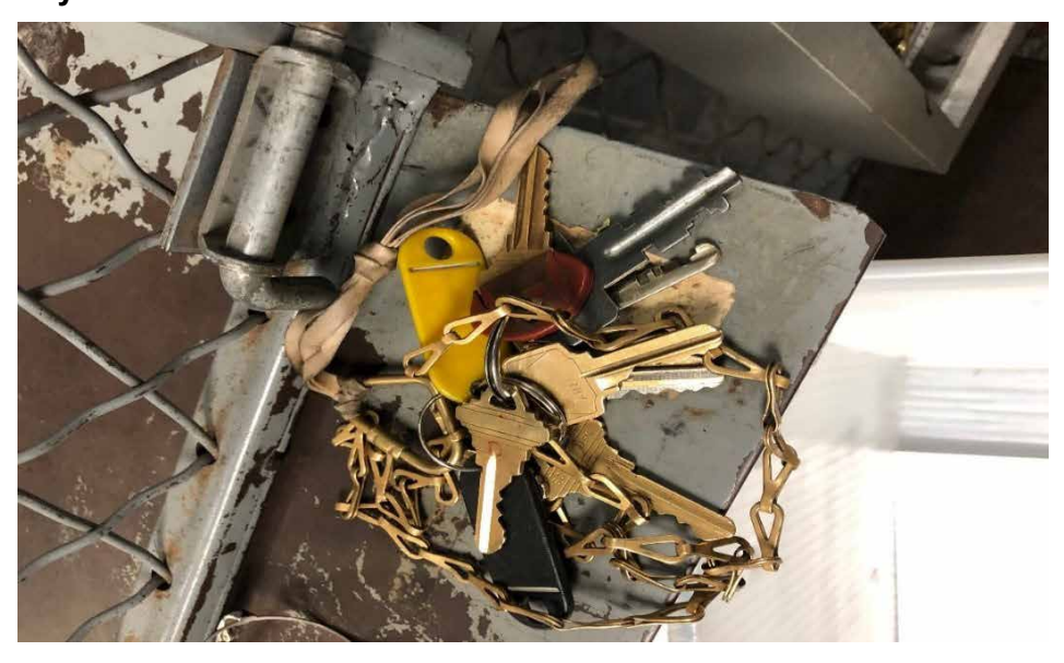
Figure 7. Williamsburg Station Route Keys With Private Keys and Key Fobs