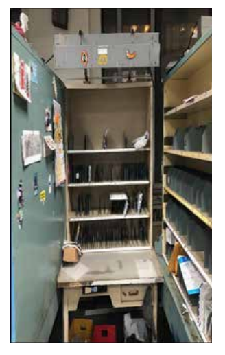
Source: U.S. Postal Service Office of Inspector General (OIG) photographs taken at the Williamsburg Station on the morning of August 27, 2019. Mail pictured was scheduled to be delivered on August 26, 2019.

Further, on the evening of August 27, 2019 we observed undelivered mail in carrier satchels, pushcarts, cases, and a vehicle. This mail was scheduled to be delivered that day and included First-Class Mail Letters, First-Class Mail Flats, and Certified Mail.