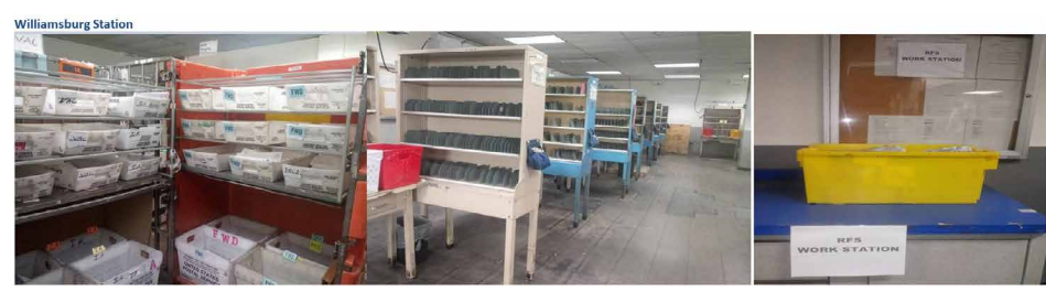
Figure 16. Williamsburg Station Workroom Floor and Carrier Cases Cleared of Mail

Source: Photographs provided by Triboro District Manager on December 23, 2019.