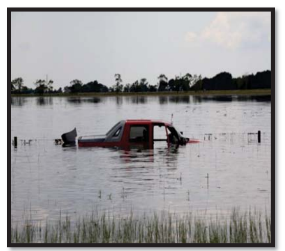
Figure 1. Hurricane Harvey damage

Under IHP, FEMA provides transportation assistance to assist individuals and households in repairing or replacing damaged or destroyed vehicles. According to FEMA, a vehicle is "repairable" if it sustains disaster-caused damage that affects its drivability or safety. Repairable damage includes a broken windshield, mirror, or headlight assembly and mechanical malfunction. A vehicle is "destroyed" if it has been declared a total loss. Circumstances of total loss include a vehicle crushed by a falling tree, completely burned, or having floodwater over the engine. (See figure 1.)