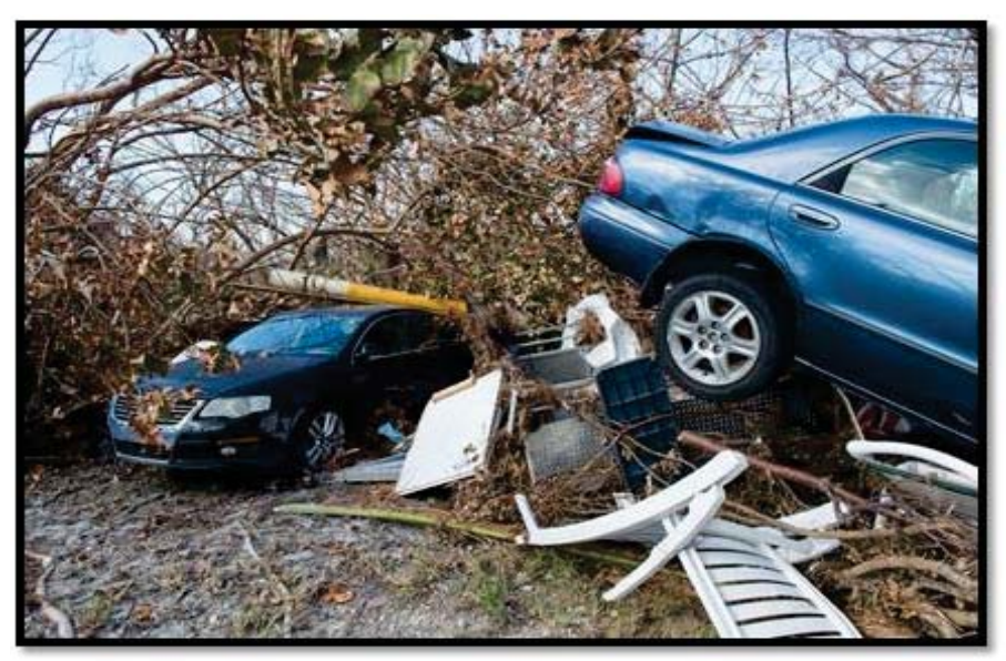
Figure 2: Damage and debris from Hurricane Irma

We conducted this inspection to determine to what extent FEMA prevented fraud, waste, and abuse of transportation assistance in response to Hurricanes Harvey, Irma, and Maria in FY 2017.