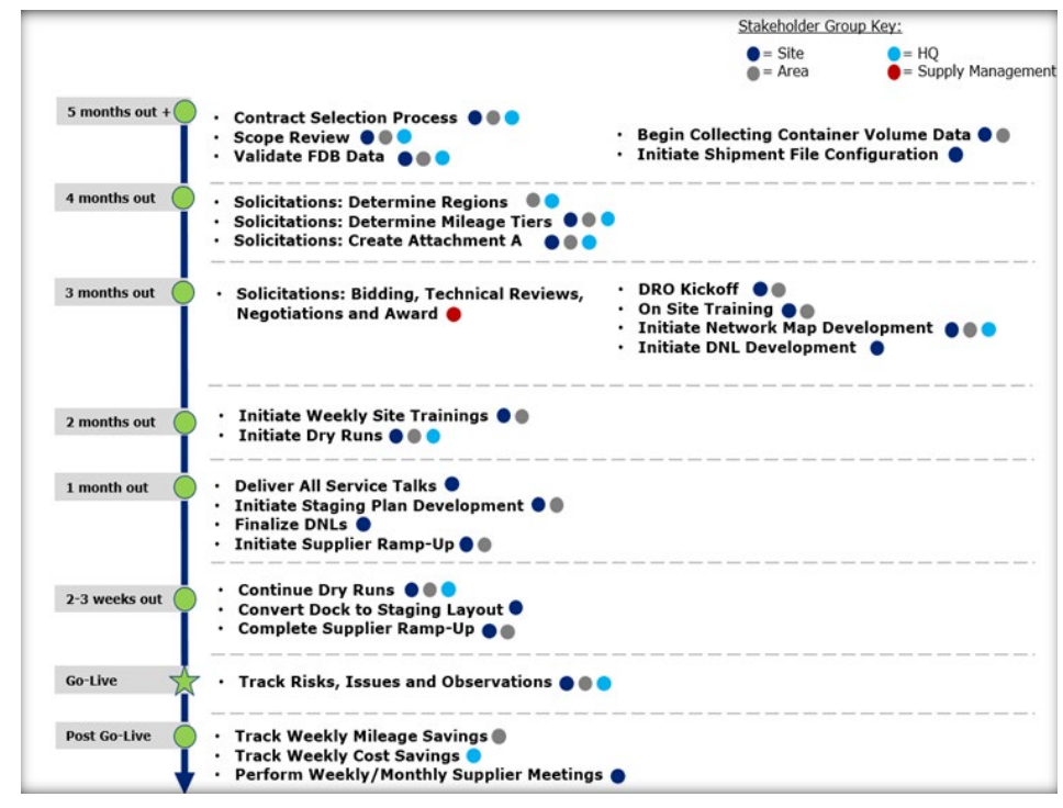
Figure 1. DRO Implementation Timeline, Activities, and Stakeholder Involvement