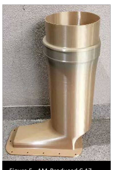
Figure 5. AM-Produced C-17 Cooling Duct

The Air Force has achieved cost savings on parts produced using AM. For example, a software maintenance group official at Tinker Air Force Base projected a $378,000 cost savings by producing AM parts to assist with testing during FY 2019.9 In addition, the Air Force used AM to produce three C-17 Globemaster III aircraft (C-17) cooling ducts. According to the Air Force, these AM-produced cooling ducts reduced the lead time by 9 months and could potentially save $12 million over a 20-year life cycle. Figure 5 shows an AM-produced C-17 cooling duct.