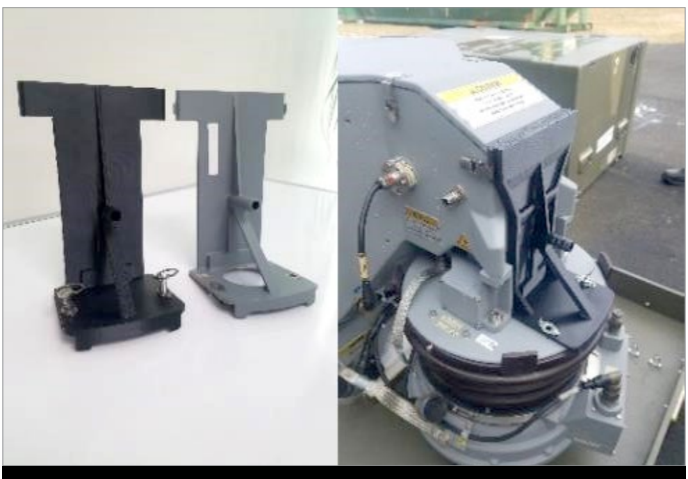
Figure 4. Traditionally Manufactured and AM-Produced MH-60R Airborne Low Frequency Sonar Covers

(FOUO) The Navy has successfully used AM parts and tools to reduce cost and improve readiness and part performance. For example, the Navy used AM to produce an MH-60R Sea Hawk Helicopter (MH-60R) sonar system cover, which was not always available in the supply system. The AM-produced sonar system cover eliminated corrosion of the traditionally manufactured cover, reduced the lead time from 2 years to 1 week, and decreased cost from $ cover. Figure 4 shows a traditionally manufactured and an AM-produced MH-60R sonar cover.