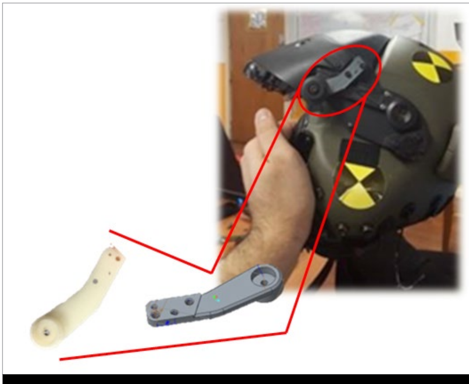
Figure 7. AM-Produced H-1 Helmet Visor Clip Source: The Marine Corps.