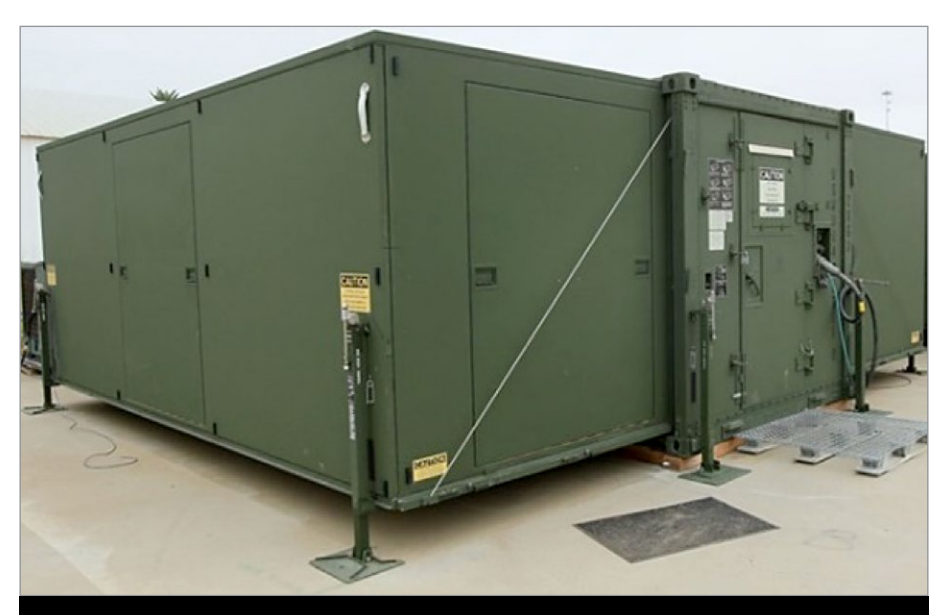
Figure 6. Expeditionary Fabrication Facility

Fabrication Facility that contains three AM printers. As of February 2019, the Marine Corps planned to deploy the Expeditionary Fabrication Facility to 21 units by FY 2024 to supplement the supply chain and return combat-damaged equipment back to service. Figure 6 shows an Expeditionary Fabrication Facility.