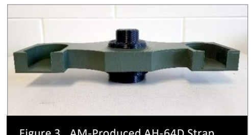
Figure 3. AM-Produced AH-64D Strap Pack Support

strap pack support, they were damaging other parts. The creation and use of the support saved 12.4 maintenance hours and $20,000 to replace the parts that may have been damaged without the AH-64D strap pack support. The strap pack support took only 9 hours to produce at a cost of $3.21. Figure 3 shows an AM-produced AH-64D strap pack support.