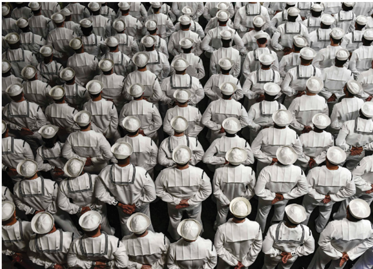
U.S. Sailors stand at parade rest during a Change of Command ceremony aboard the amphibious assault ship USS Wasp in Subic Bay, Philippines.