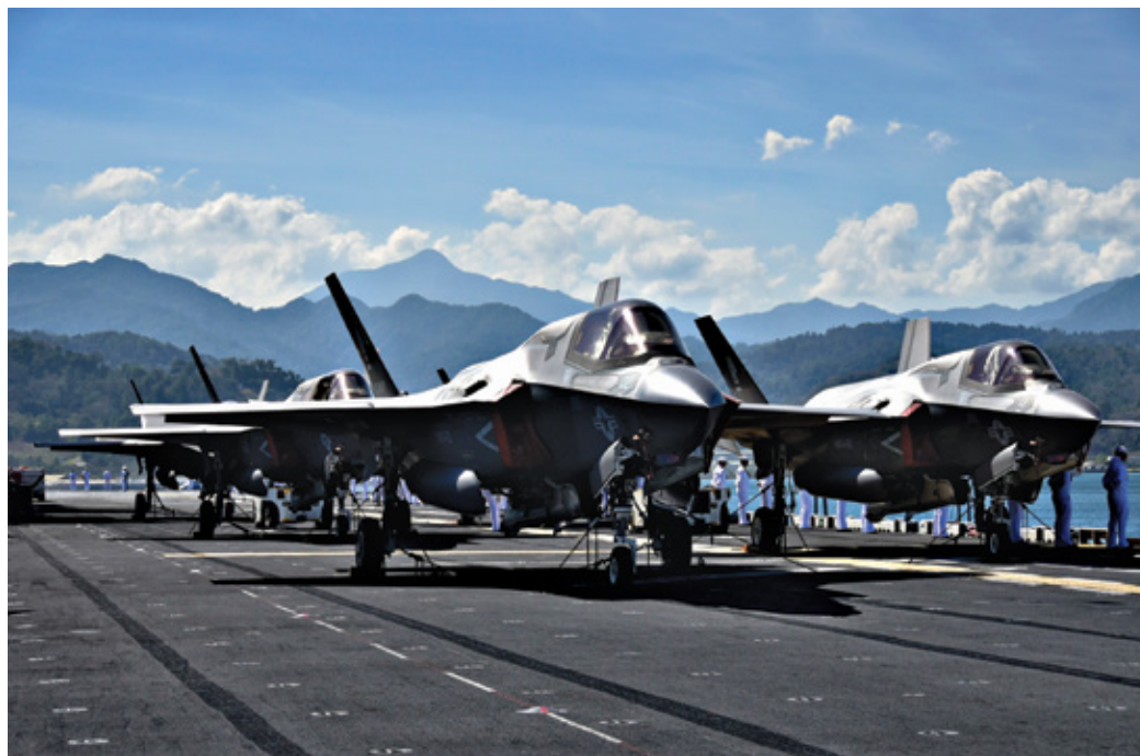
F-35B Lightning II aircraft are secured to the flight deck as sailors man the rails aboard the amphibious assault ship USS Wasp .

According to media sources, the 2019 Exercise Balikatan included training activities to prepare the AFP to combat both conventional military and insurgent threats. A U.S. Army spokesperson stated, “If [the Philippines] were to have any small islands taken over by a foreign military, this is definitely a dress rehearsal that can be used in the future.” Many of the elements of this exercise were requested by the 1-year old Philippine Special Operations Command to prepare for scenarios, such as a foreign-power invasion, while simultaneously fighting extremist militants. An AFP spokesperson told reporters that he hoped the training would address some of the issues that challenged the Philippine forces during the 2017 siege of Marawi, such as overreliance on special operations units and difficulty coordinating accurate airstrikes. 67