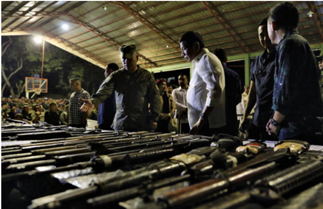
Philippine President Rodrigo Duterte inspects firearms confiscated from terrorists at Camp Teodulfo Bautista in Jolo, Sulu.

influential ISIS-EA leader in the Philippines, commanding the largest faction of fighters. He was also implicated in the Philippines’ two deadliest terrorist attacks of 2019: the Jolo cathedral bombing in January and the Indanan army camp attack in June, which took place within 10 miles of each other on the island of Jolo. 46