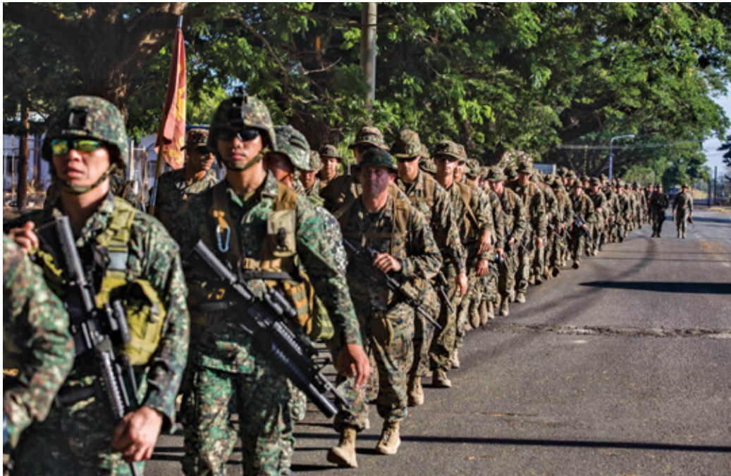
U.S. Marines march with Philippine Marines on their way to conduct room clearing drills during Exercise Balikatan at the Navy Education Training Command.

A report issued by the International Crisis Group this quarter stated that if the BARMM could meet popular expectations regarding delivery of public services, such as health, education, and infrastructure, it could mitigate the anti-government sentiments that have