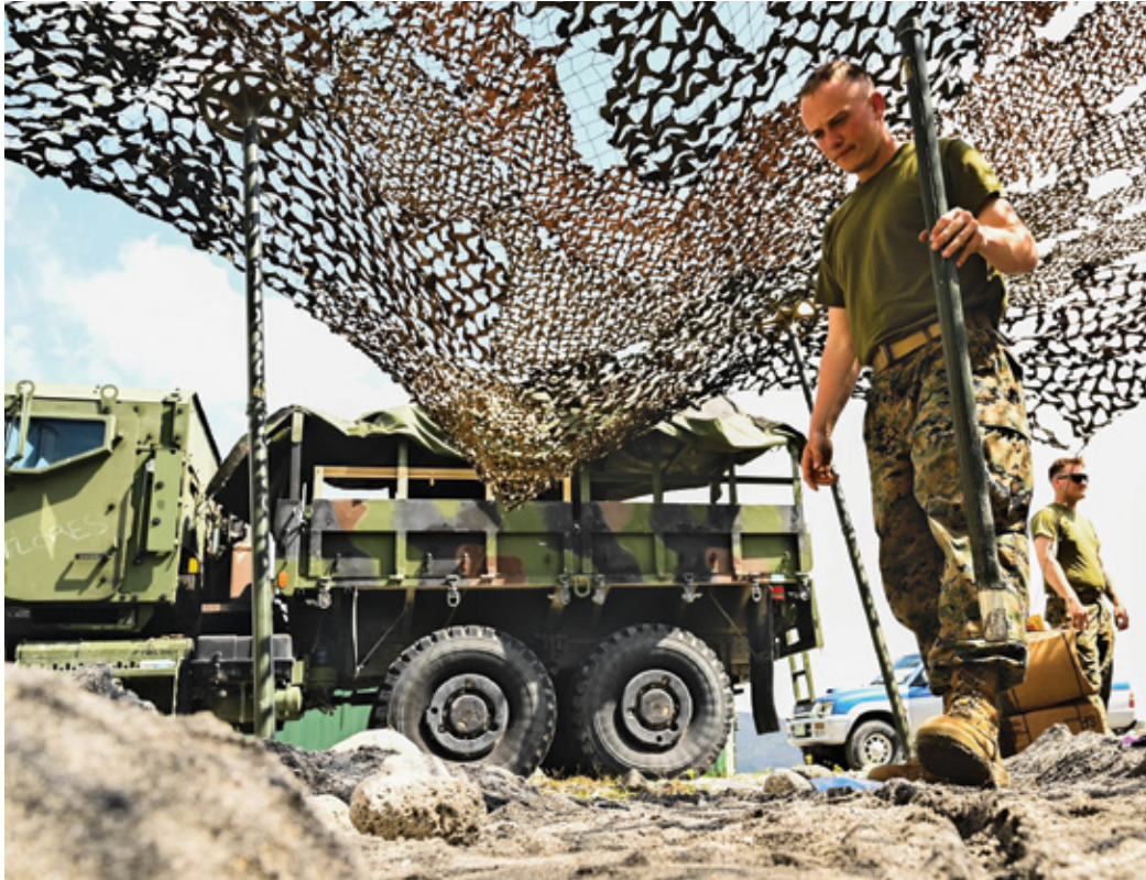
A U.S. Marine works on a terrain model during river crossing operations.

USAID reported that its programs in the Philippines this quarter focused primarily on rebuilding communities and countering violent extremism. The largest of these activities, the $25 million Marawi Response Program, provided micro-grants for 11,629 IDPs and 55 business recovery grants, along with workforce and entrepreneur training. USAID said that programs designed to counter violent extremism supported town halls related to the Bangsamoro peace process, interfaith dialogue between Muslims and Christians, efforts to prevent school dropouts, and conflict resolution skills for religious, women, and youth leaders. 21