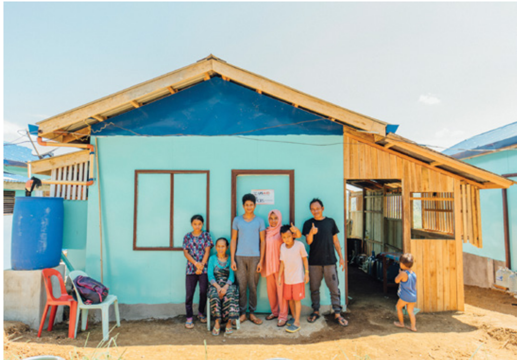
A temporary shelter in Pataon.