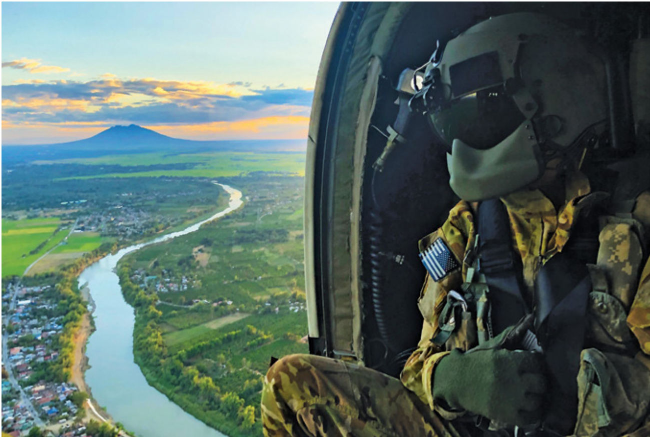
A U.S. Army crew chief studies terrain aboard a UH-60 Black Hawk helicopter as part of a flight survey.