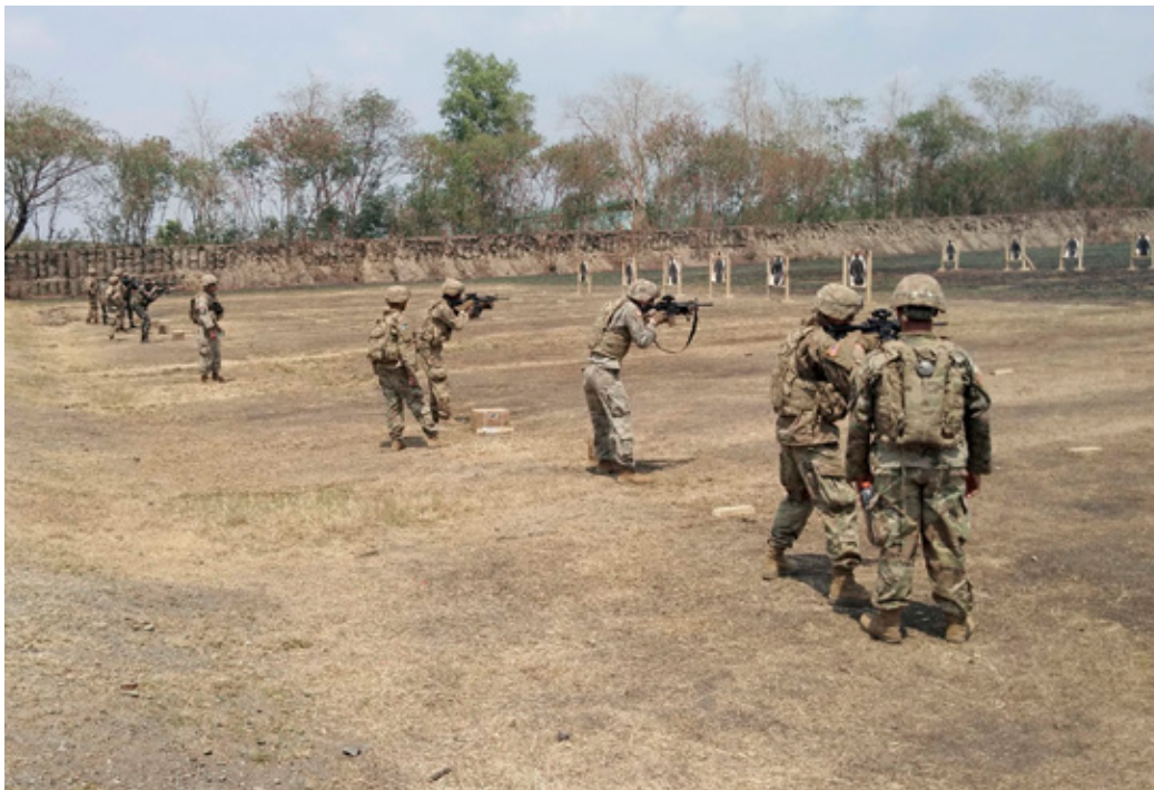
U.S. and Philippine soldiers hone their marksmanship skills at a range during Exercise Salaknib.

The DoS Bureau of Diplomatic Security, Bureau of Counterterrorism and Countering Violent Extremism, and U.S. Embassy Manila conducted 10 training courses with Philippine partners this quarter and has 23 planned for next quarter, according to the DoS. Courses conducted in the Philippines this quarter included crisis response and critical infrastructure, airport, and bus and rail system security. This training, provided through the DoS Anti-Terrorism Assistance program, was primarily directed toward the PNP's special security operations units, the Special Action Force. 73