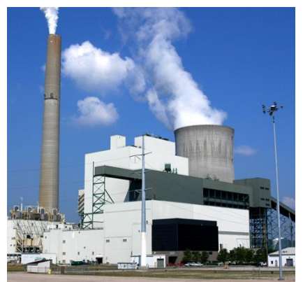
Typical coal-fired power plant; such a facility may have multiple units subject to the ARP, CSAPR and 40 CFR Part 75 monitoring requirements.