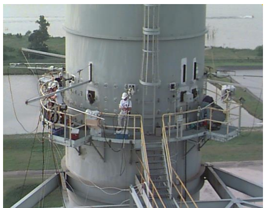
Stack testers performing a RATA.

Facilities are required to report electronically to the EPA their monitoring-related data, including a monitoring plan, and results of required QA/QC tests. Facilities report this information to the EPA using an electronic reporting system called the Emissions Collection and Monitoring Plan System (ECMPS). It is important for reported Part 75 CEMS data to be accurate and meet regulatory requirements because these data are used to assess compliance with trading program emissions limits and progress toward environmental goals. Accurate data are also important to verify the integrity of the allowances that are bought and sold under the cap and trade