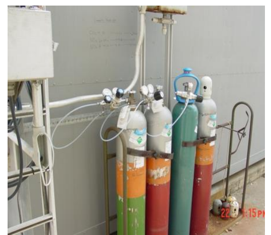
Calibration gas cylinders.

The EPA requires that CEMSs be tested with certified reference gases at certain concentration ranges, depending on the span<sup>8</sup> of the monitor, for both daily calibration error checks and quarterly linearity checks. We reviewed the reported test result data for daily calibration error checks and linearity checks to determine whether the reference gas concentrations for each test met the requirements in 40 CFR Part 75. We found that the reference gas concentrations used for these tests were within the required ranges. However, we found some