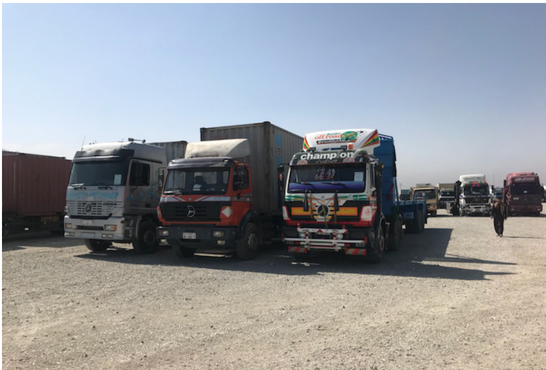
Figure 1. NAT 3.0 Trucks at the National Afghan Trucking Yard

The purpose of the National Afghan Trucking program is to provide U.S. and Coalition forces with secure and reliable means of distributing reconstruction material, security equipment, fuel, miscellaneous dry cargo, and life support assets to and from forward operating bases and distribution sites throughout Combined Joint Operations Area–Afghanistan. Figure 1 shows NAT 3.0 trucks at the NAT Yard waiting to load and unload cargo.