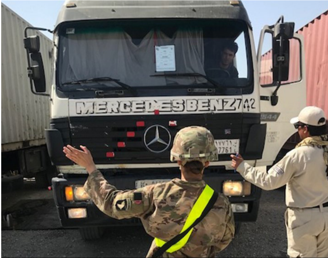
Figure 2. COR Performs Maintenance Inspection on a NAT 3.0 Truck