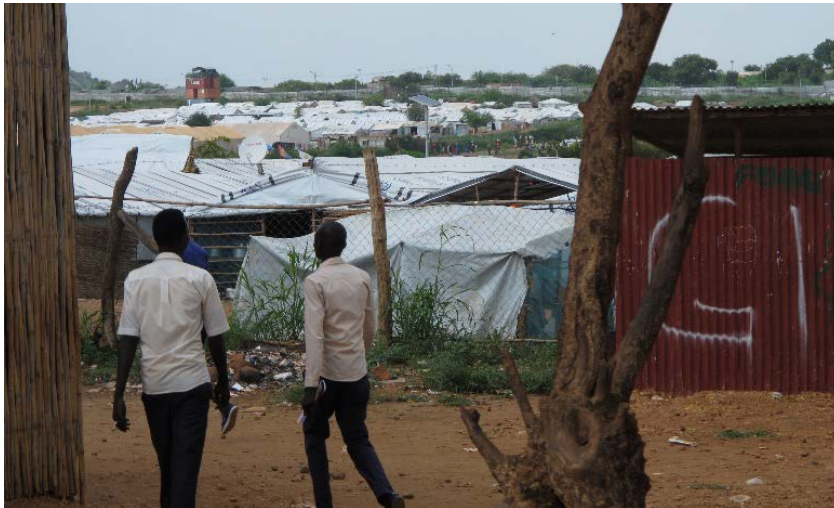
Figure 4. UN Mission in South Sudan established Protection of Civilian Sites to help protect South Sudanese IDPs. The photograph shows Protection of Civilian Site No. 3 in Juba, South Sudan established in August 2014.

terrorist activities, poor infrastructure, drought, famine, and criminal activities, such as smuggling and trafficking in persons.