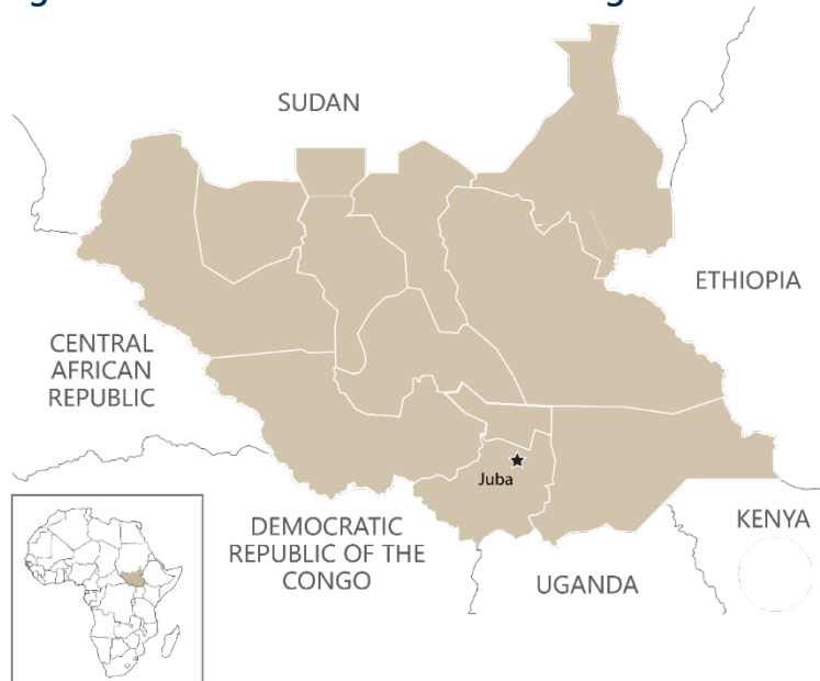
Figure 1: South Sudan and Surrounding Countries