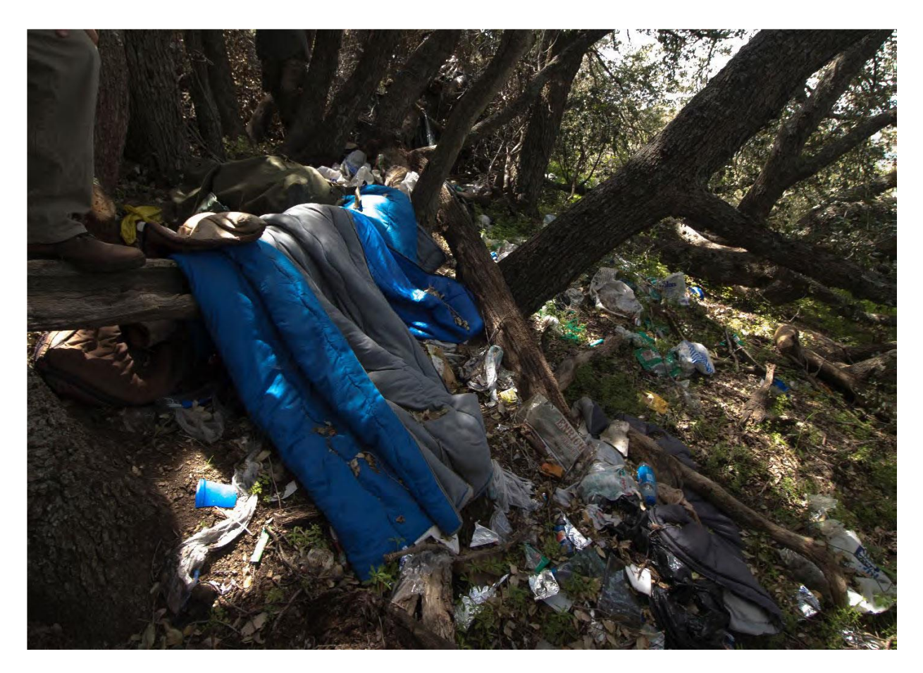
Figure 2: Trash, fertilizer, and chemicals left at a marijuana grow site in Sequoia National Forest.

of the grow sites.<sup>9</sup> Both sites visited within the Daniel Boone National Forest had some trash onsite; however, neither had piping nor equipment. According to Region 8 LEI staff, the growers on Daniel Boone National Forest do not use the piping and chemicals that growers in California use.