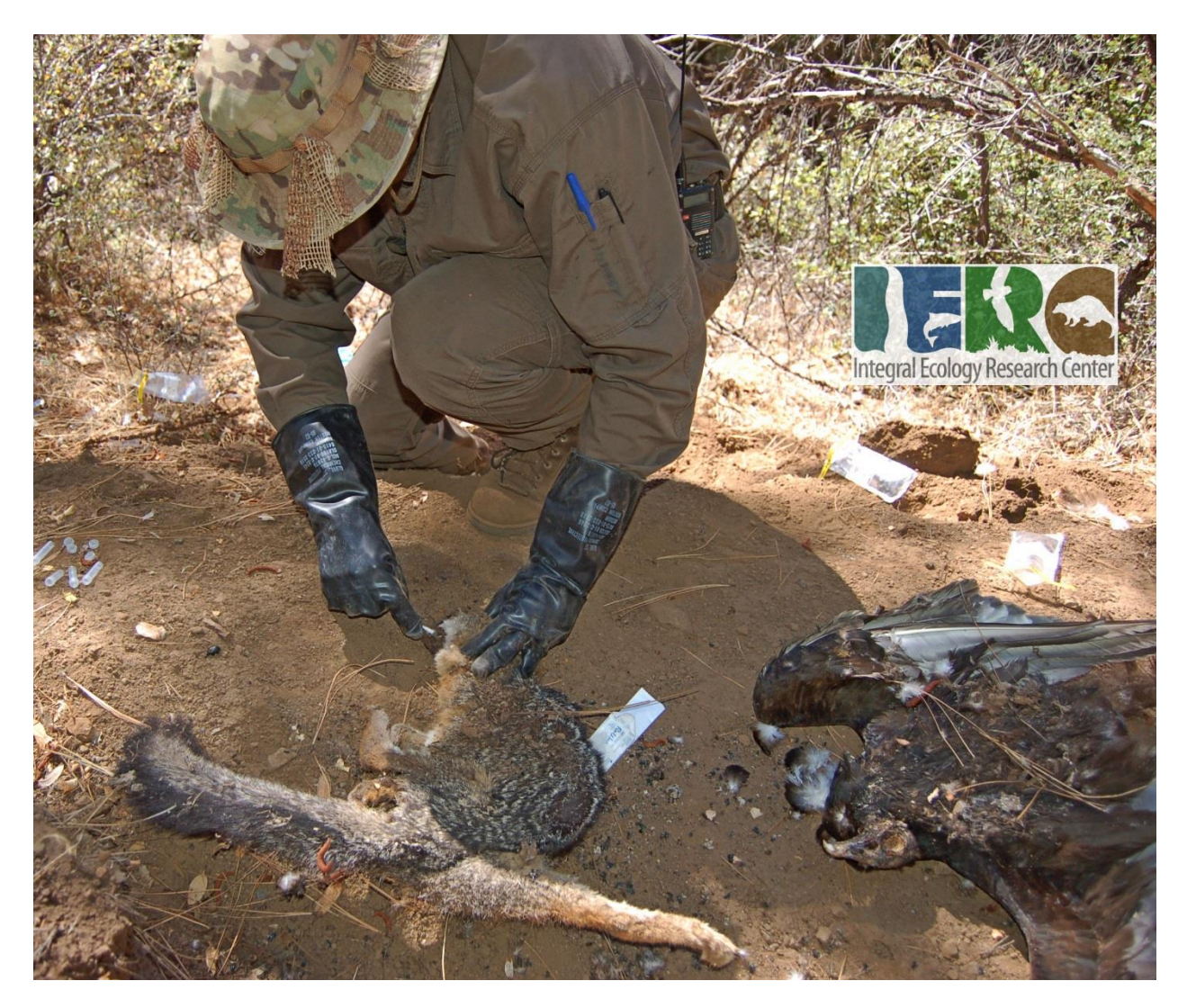
Figure 3: Executive Director/Senior Ecologist of the IERC (Integral Ecology Research Center)<sup>11</sup> samples a fox and vulture found dead at a marijuana grow site on the Lassen National Forest in California. The small black dots on the ground between the animals are flies that died from eating the decaying carcasses.

In addition to the hazardous materials, as noted earlier in this finding, we found that the growers' infrastructure, specifically irrigation piping as well as trash and equipment, was still present at grow sites several years after eradication efforts. When infrastructure and materials are not removed, we believe this allows grow sites to be more easily reactivated year after year. We witnessed a possible reactivated grow site during one of our visits to Los Padres National Forest. While hiking into the grow site, LEI officers indicated the new trash and fertilizers as signs of new activity and stated that the grow site was most likely reactivated. We conclude that if FS